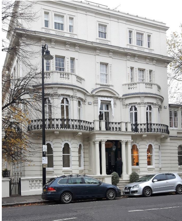
Figure 1. The Peak of Notting Hill.