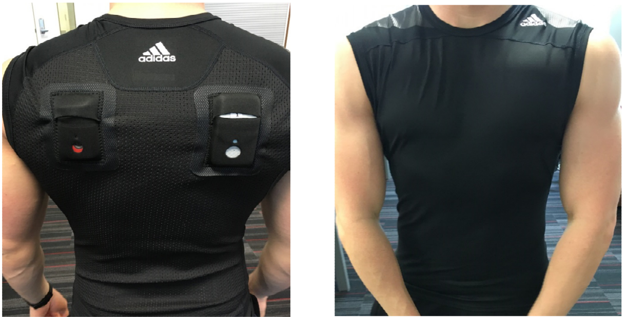
Figure 3.1: Participant wearing both models of device in a custom designed vest.

After the units were collected from the players post testing, data were downloaded to a computer via multi-unit docking ports. Data from the GPSports units were downloaded using Team AMS Release R1 2012.4 (GPSports, Canberra, Australia). Data from the Statsports units were downloaded using Statsports v.2.0.2.5 (Statsports, Dundalk, Ireland) before being exported into Microsoft Excel (Microsoft Corporation, USA) for further analysis.