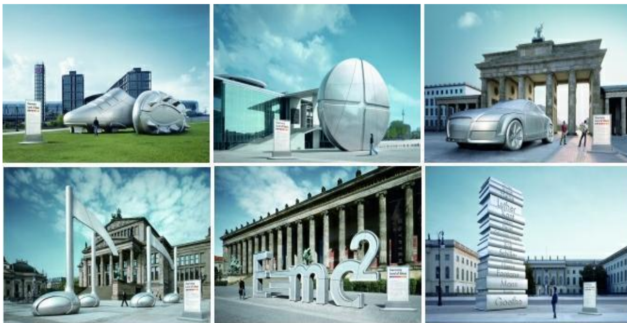
Figure 2: “Land of Ideas” (DLI s. a.)

Each of these sculptures highlights a well-known German invention or contribution to civilization, thereby underscoring Germany’s well-deserved reputation for technological prowess. Aimed at international visitors attending the World Cup, the sculptures function as an effective branding tool precisely because the iconography, all of which is evocative of positive developments in human society, is easily recognizable as German. In this case, no attempt is made to evoke and undermine a negative stereotype, as the Pepsi ad did, but simply to encourage viewers to reflect on Germany’s many positive contributions to modern society.