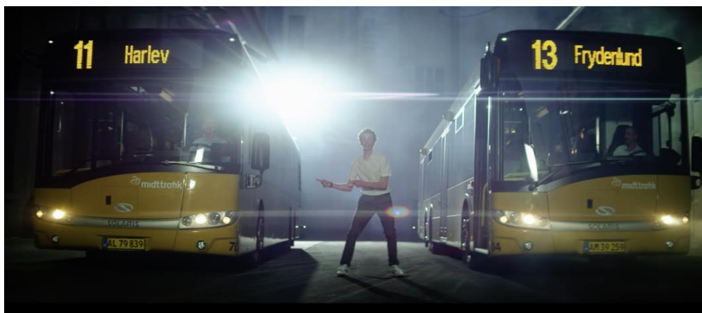
Figure 4: "The Passenger" (Midttrafik 2015)

A follow-up ad, Buskenden ('The Passenger', Midttrafik 2015), challenges this negative perception of public transportation by making good-natured fun of the stereotype of bus riders as unfashionable geeks in order to send the opposite message, namely that riding the bus is cool, sexy, and very Danish, as well as attractive to foreigners, such as a swimsuit- and tiara-clad Miss Uruguay, who watches the passenger, whose appearance resembles that of the title character of the 2004 American cult film Napoleon Dynamite , with wide eyes and parted lips in obvious, sensual admiration (cf. Midttrafik 2015).