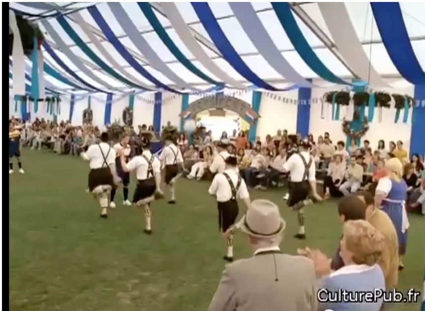
Figure 1: “Oktoberfest World Cup” (Pepsi 2010)

Through its tongue-in-cheek use of such well-known stereotypes of Bavarian beer culture, Lederhosen , and buxom blond women, the ad conveys an atmosphere of relaxation and celebration that resonated with foreign visitors and improved their perception of Germany and its World Cup team. Crossland reports that only a few days into the 2006 World Cup, then-British Prime Minister Tony Blair published an opinion piece in Bild am Sonntag about why British fans were supporting the German team. He declared, “The old clichés have been replaced by a new, positive and more fair image of Germany” (Crossland 2006). In Crossland’s view, this improved image of Germany that resulted from the World Cup campaign allowed “feelings of patriotism stifled for decades by the Holocaust” to resurface, “as Germans started attaching not just one but two and sometimes four national flags to their cars, painted neat little flags onto their faces and cleavages and donned wigs and bras in the national colors of black, red and gold” (Crossland 2006). The benefits of the effective use of positive national stereotypes allowed not only foreigners but also Germans themselves to reevaluate their view of Germany’s national brand and, by extension, national character. As a result, being German became something to be proud of, a sentiment that manifested itself in otherwise unusual displays of the German flag throughout the country during the event.