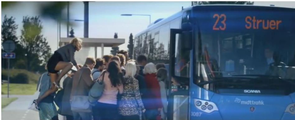
Figure 3: "The Bus" (Midttrafik 2012)

The first ad in the series, titled Bussen ('The Bus', cf. Midttrafik 2012), uses a dramatic off-screen narrator and slow-motion pantomime to tout the benefits of riding the bus, with its plush seats, big windows, designer bells, free grips, and cool drivers. Crowds of people fight to board the bus, caress the seats, and gaze in fascination at the "impressive views" (Midttrafik 2012) of their neighbors taking out their trash.