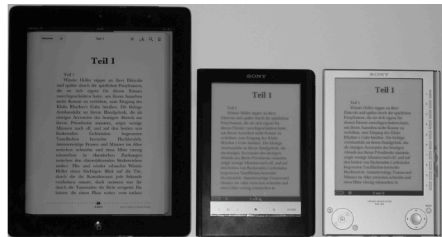
Figure 1. Apple iPad, first generation, Sony Reader PRS-600 and Sony Reader PRS-505 (from left to right).

LCD vs. E-ink: An Analysis of the Reading Behavior approximately 30x20x30cm. The experiment took place in constant artificial light conditions with indirect ceiling light and without direct sunlight. The reading devices (see Figure 1) used, were two e-reading devices with e-Ink (Sony e-reader Model PRS-600 and Model PRS-505) and a Tablet with backlit LED-Screen (Apple iPad, first generation). For all devices the luminance (cd/m 2 ) of dark font (LF) and light background (LB) was measured using a Luxmeter (Minolta LS-110). Technical specifications of the reading devices are shown in Table 1. Background luminance on the iPad was kept constant. Standard software for reading was used (iBook for iPad, Sony reader software for PRS-505 and PRS-600). Words on each device were equal (300 words per section). Text format was in the ePub-format.