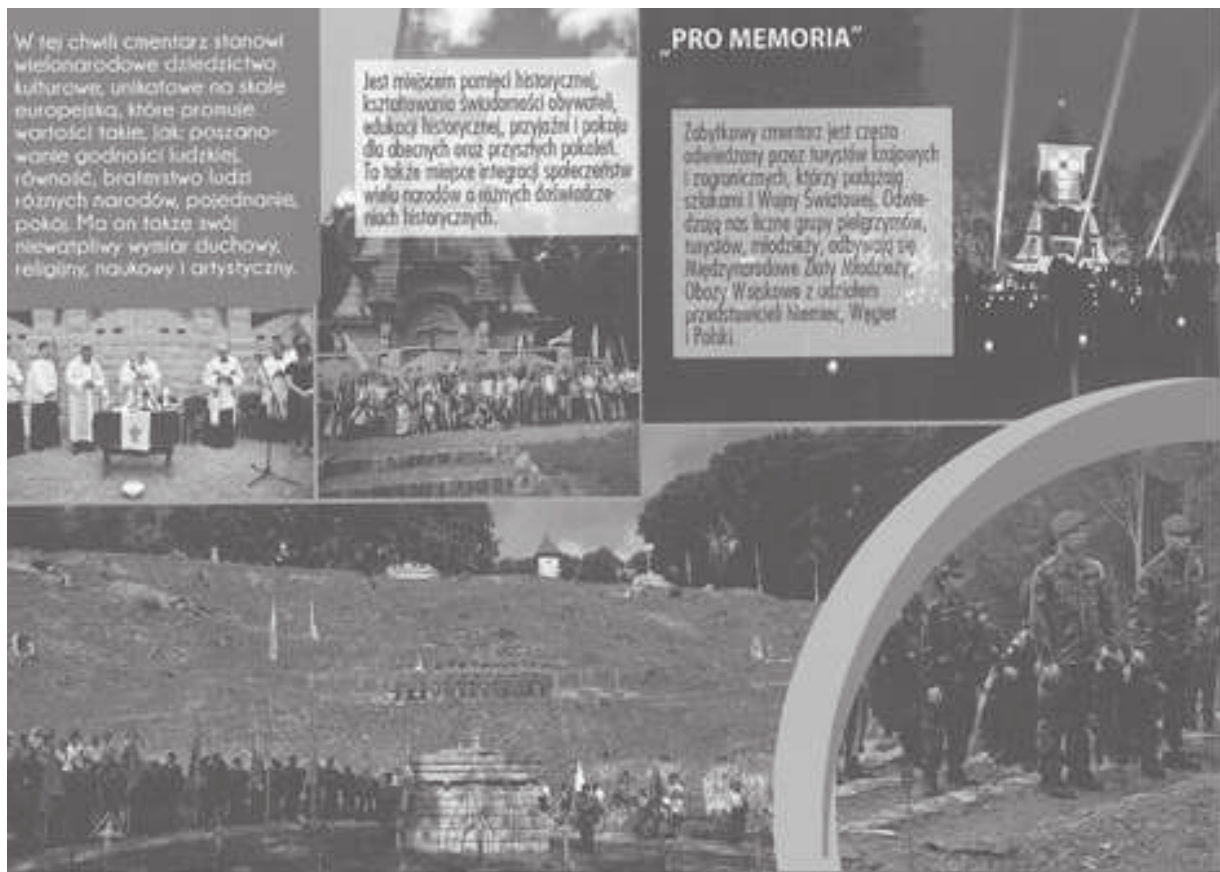
Fig.3. Page from the brochure prepared by the Local Authority of Łużna to mark the award of the European Heritage Label