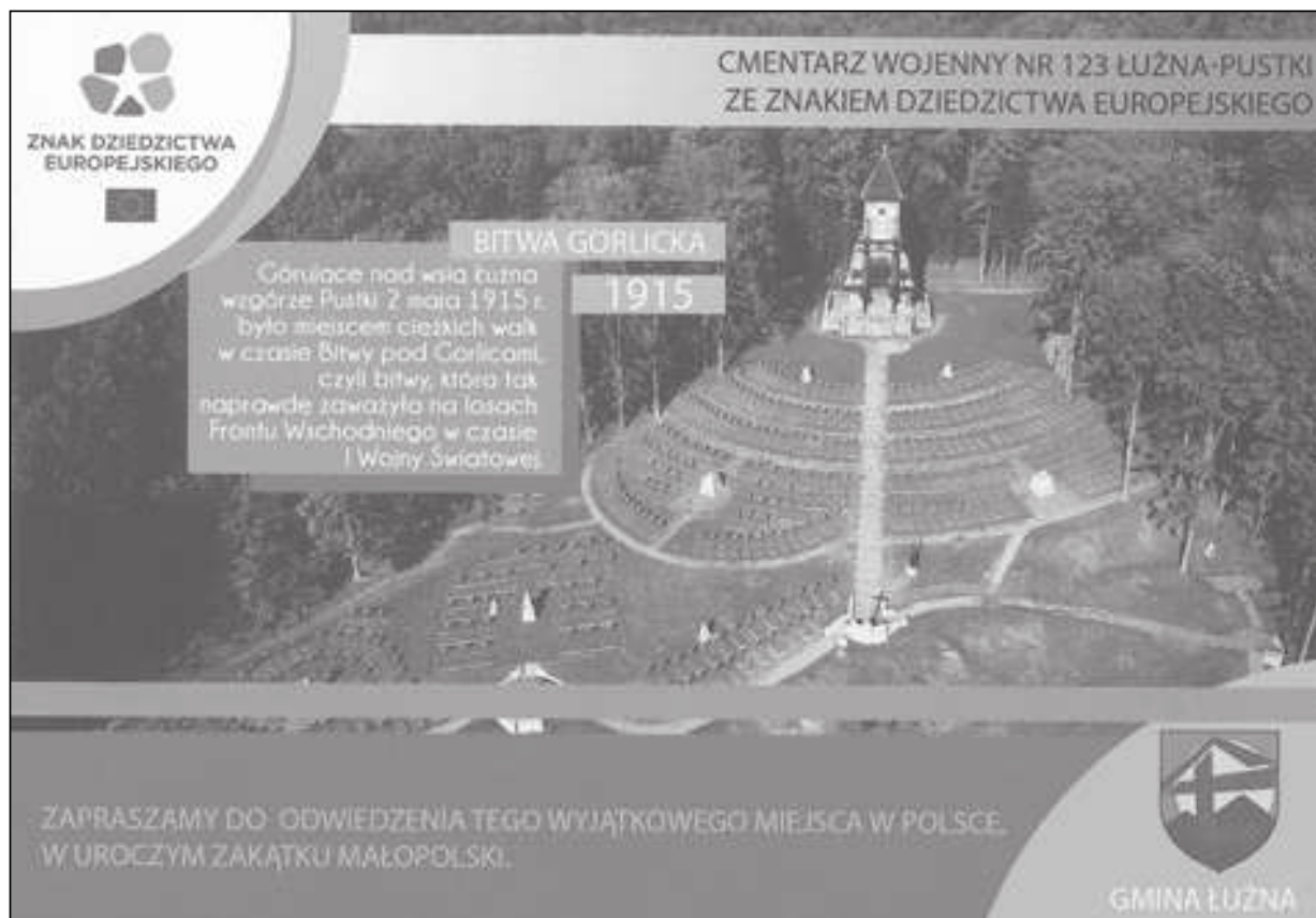
Fig.1. Cover of the brochure prepared by the Local Authority of Łużna to mark the award of the European Heritage Label

© photo: A. Ziobrowski, T. Machowski, D. Bugno, P. Sekuła; graphic design: T. Machowski, D. Bugno © Łużna Commune Office