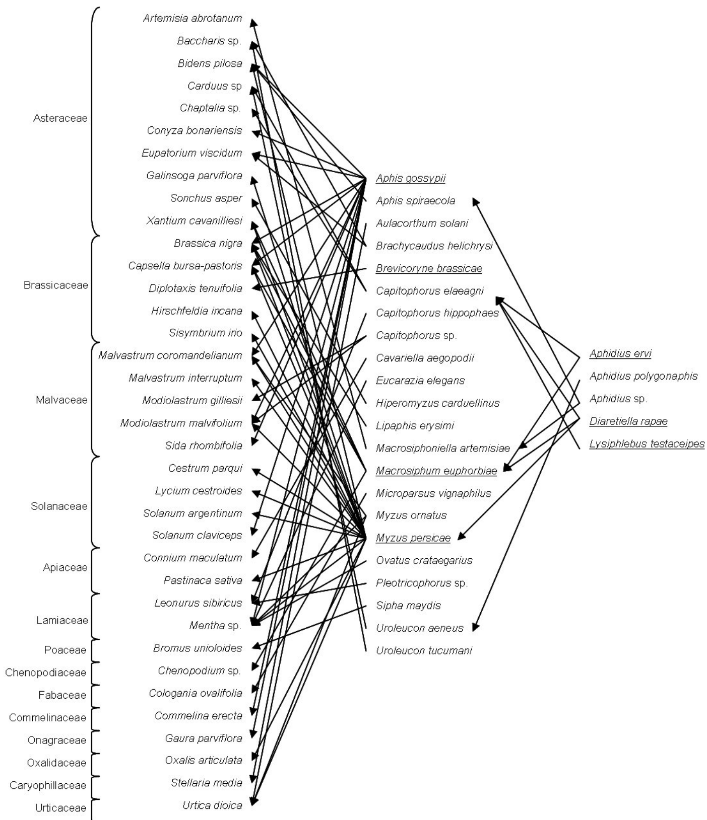
Figure 2. Plant-aphid-parasitoid interactions in a non-cultivated habitat adjacent to a vegetable crop in an organic farm in Córdoba, Central Argentina. Underlined aphid and parasitoid species are common to both habitats (i.e. cultivated and non-cultivated; see Figure 1).

individuals (Table 2). B. brassicae also had only one host plant in this habitat, Diplotaxis tenuifolia (L.) DC. (Brassicaceae); whereas M. euphorbiae was found on four different plant species (Figure 2).