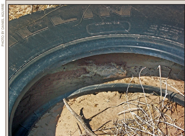
FIG. 1. A dead Texas Horned Lizard, Phrynosoma cornutum , in a tire.