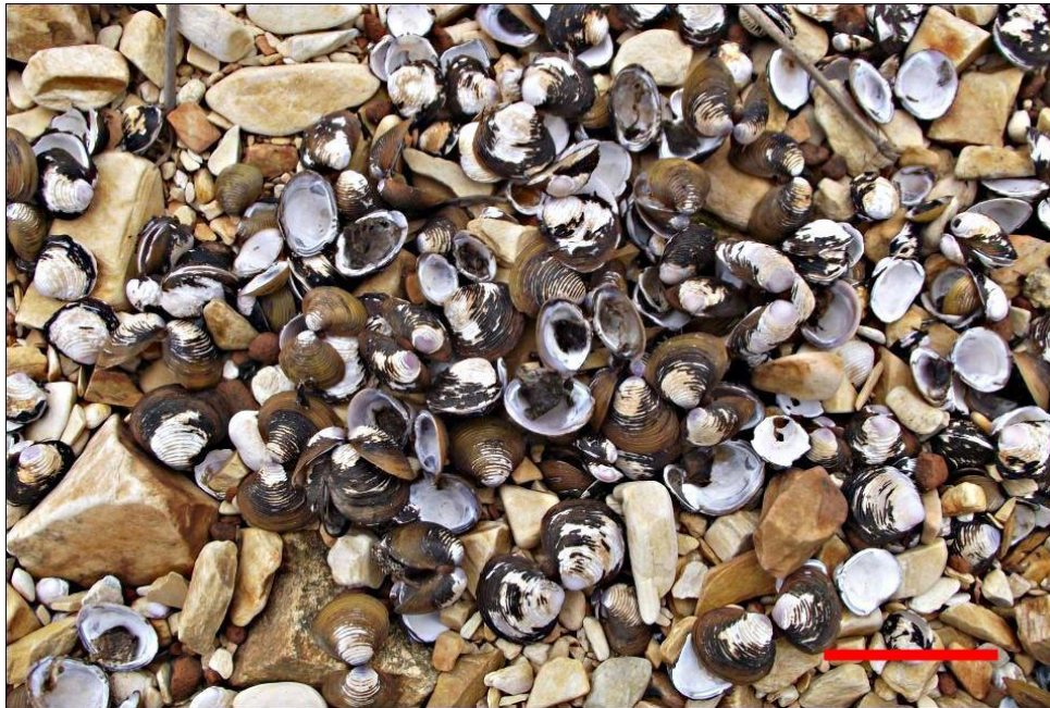
Figure 1. Furnas reservoir sampling site with great accumulation of Corbicula fluminea dead shells, indicating high density of this specie. (Photo: V. M. Azevedo-Santos). Bar: 4 cm.

fluminea for the first time in the lower basin of the Brazilian Amazon, where individuals were found in parts of Amazonas and Tocantins rivers, and estimated that the arrival of this species occurred between 1997 and 1998. Santos et al. (2012) also confirmed the presence of this species in upper Parana and lower Amazonas (e.g. Araguaia).