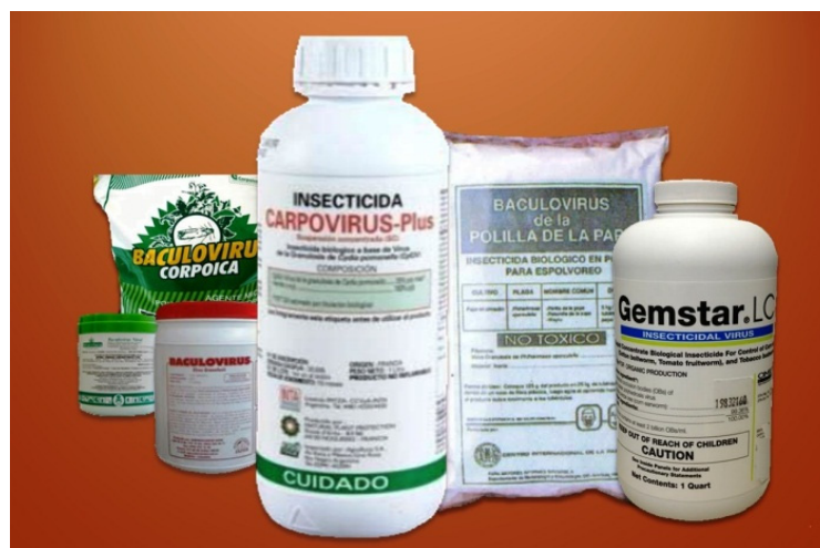
Figure 3. Some baculoviral pesticides commercialized in Latin America.

Note: the superscripts (1-19) are included for disambiguation in order to associate the biopesticide (product), the producer company and the country or countries where the particular biopesticides are applied. In particular, two products identified with the same designation, e.i. PTM baculovirus 16,17 are produced by different organizations in two different countries Peru 16 and Costa Rica 17 .