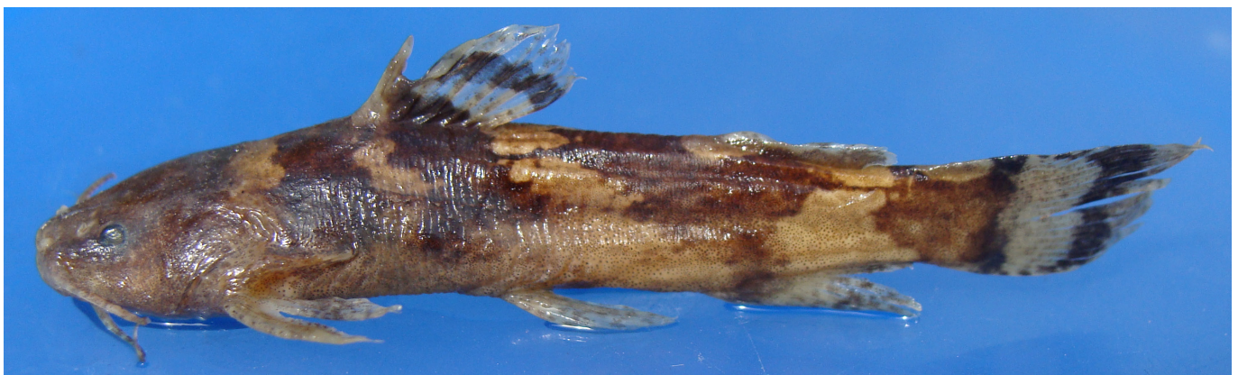
FIGURE 1. Microglanis cottoides , MCN 1514, 41.9 SL mm, Romano River at the intersection with Provincial route 380, Tucumán Province, Argentina.

The specimen was caught in dark water, shallow stream with sand, gravel, and woody debris (Figure 3). Microglanis is omnivorous and nocturnal, hiding during the day in rocky caves, under driftwood, or buried in the