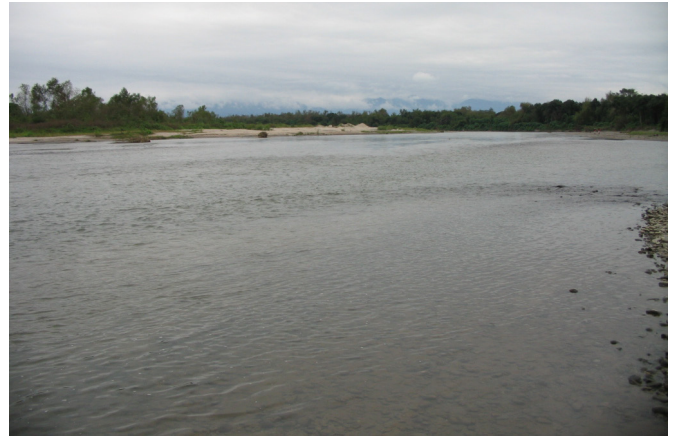
FIGURE 3. Habitat of Microglanis cottoides , Romano River, Salí-Dulce endorheic River basin, Tucumán Province, Argentina.

ACKNOWLEDGMENTS: This study was in partially supported by the research project PIP# 11420090100321 (CONICET).