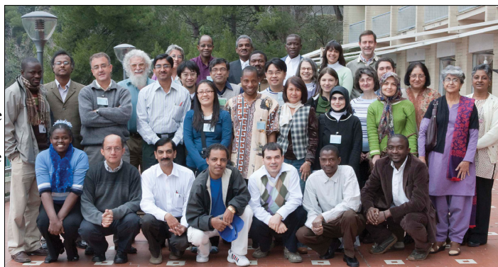
Fig. 1. Physware group photo.

sliding objects. We discovered that “g” is extremely hard to measure directly without electronic technology or the introduction of some of Galileo’s famous tricks.