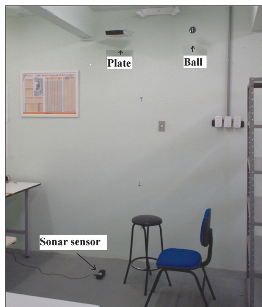
Fig. 1. Experimental setup, as seen from the position of the recording cell phone and digital camera.

Figure 1 shows the basic experimental setup. Two identical objects of equal mass, consisting of disposable aluminum pie plates (28 cm x 22 cm), are used. One object is compacted to form a ball of approximately 7-cm diameter. The objects are