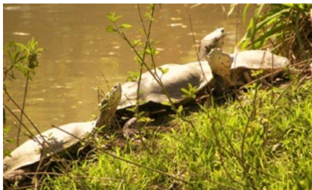
Fig 1. Adult specimens of Phrynops hilarii (approximately 4-5 kg).

counts, differential leukocyte count (DLC), Ht and Hb.