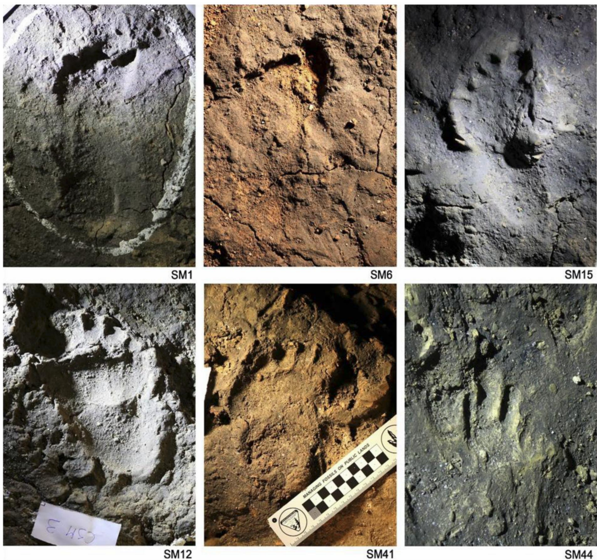
Fig. 1 - Human footprints, bear footprints and human traces preserved in the 'Sala dei Misteri' in the Grotta della Basura SM1, SM6, SM15 human footprints; SM12 adult bear footprint; SM41 immature bear footprint; SM44 human finger traces.

double-checked, using photos and photogrammetric models. The measurements of human footprints are based on both the landmark proposed by Robbins (1985), and on studies following the forensics medicine methods. For all the studied footprints, a photogrammetric model was obtained using photos taken with a 24 Megapixel Canon EOS 750D (18 mm focal length). The software used to build the models in this paper is Agisoft PhotoScan Pro, ( www.agisoft.com ), among the most user-friendly programs for photogrammetry' (Mallison and Wings, 2014). The accuracy of the obtained models is up to 1 mm for close-range photography (Fig. 2).