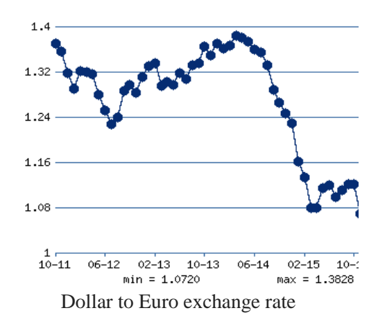
Figure 1. Rates of leading currency pairs for the period from October 2011 to June 2016