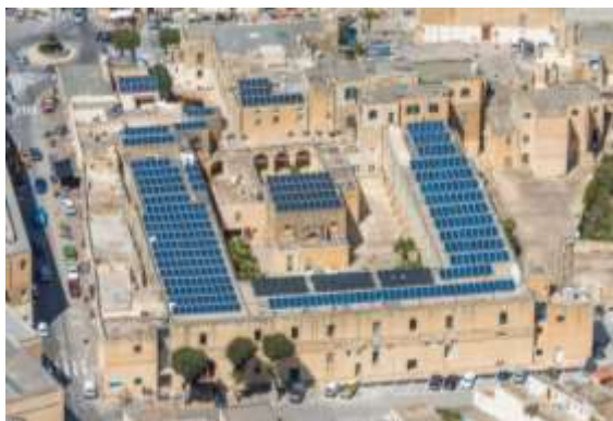
Figure 1: The Ministry for Gozo Administration Centre

The building also incorporates a PV system having a peak power of 108.1 kWp, which operates through a net metering arrangement. The PV system is made of a mixture of polycrystalline and monocrystalline PV panels and generates between 150,000 and 180,000 kWh annually, which covers 50% of the premises' electricity demand.