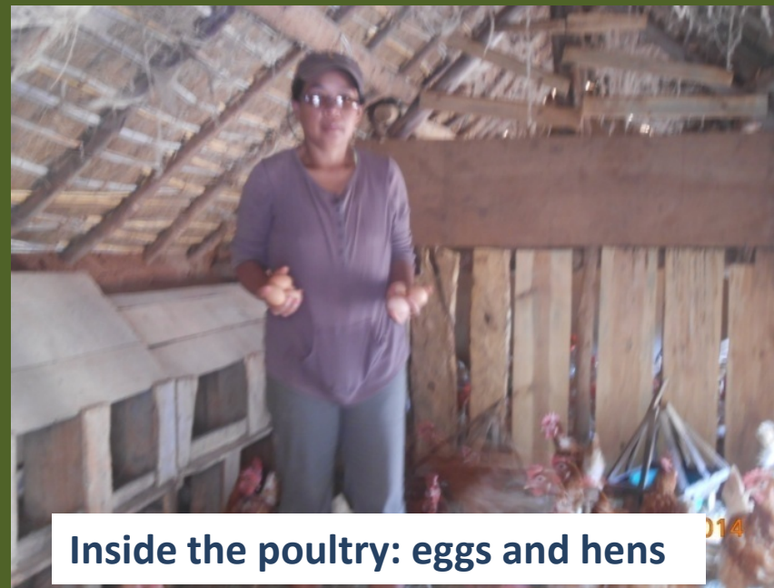
Inside the poultry: eggs and hens 14