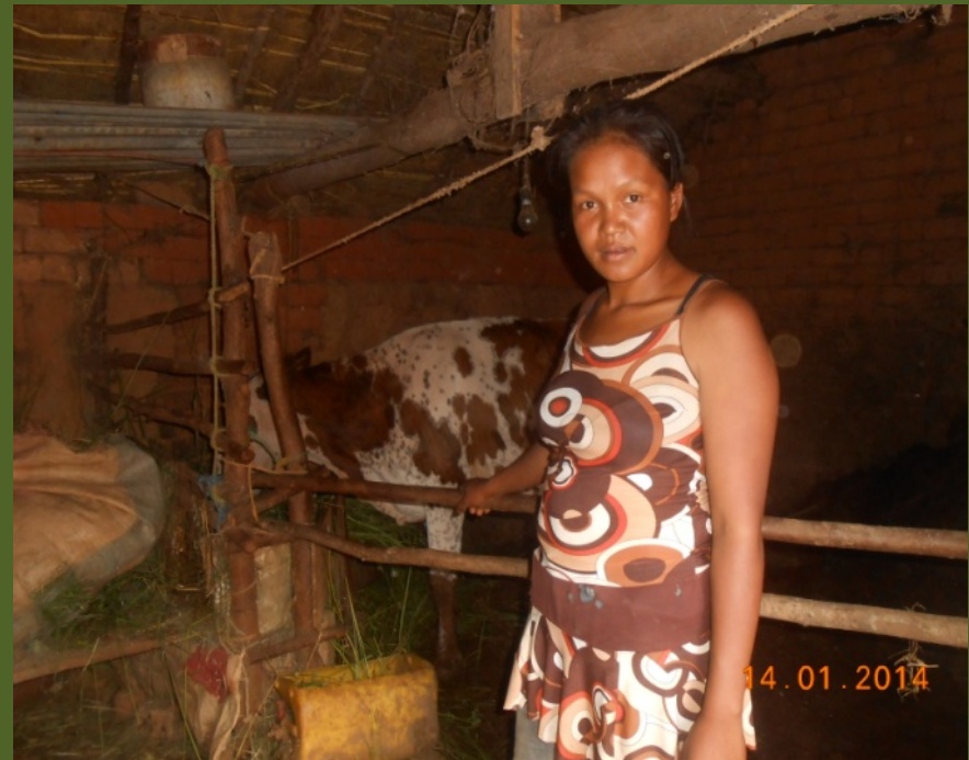
Farmer and her newly bought dairy cow