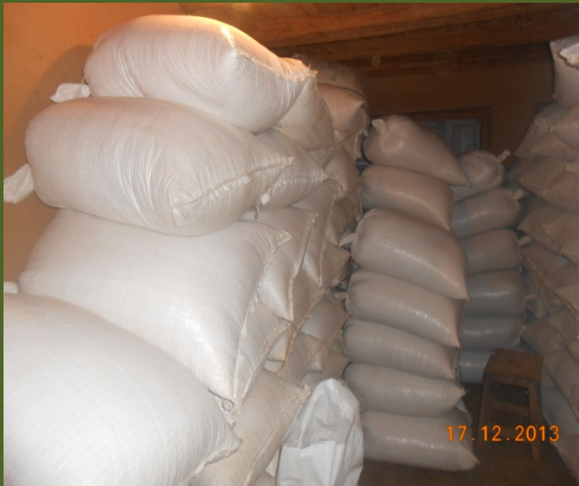
Room intended for bean storage