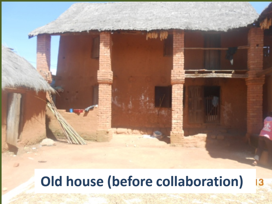
Old house (before collaboration) 13