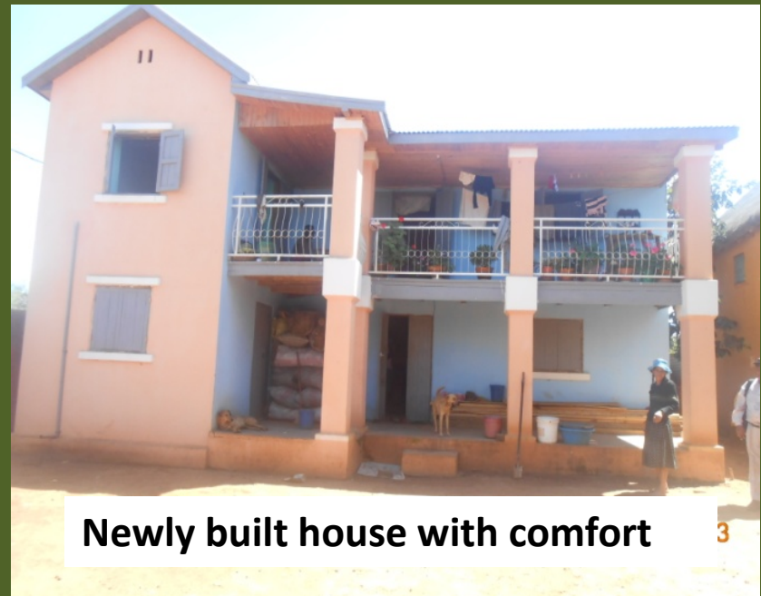
Newly built house with comfort 3