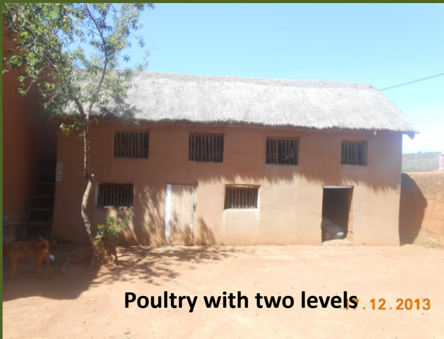
Poultry with two levels .12.2013