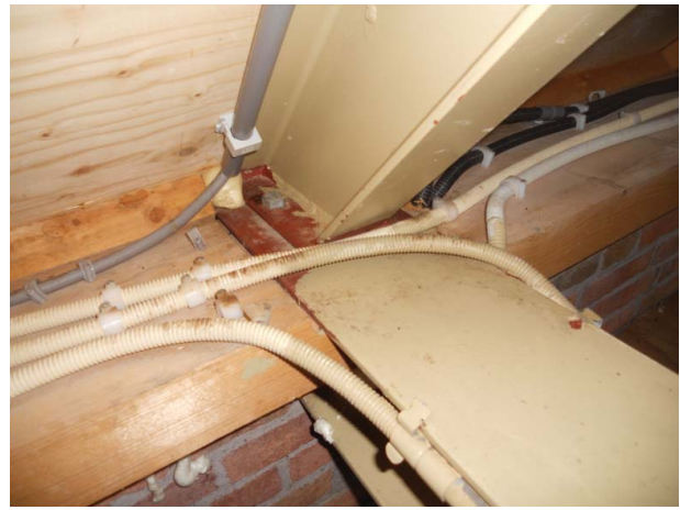
Figure 2. Grease from the coat of rodents is transferred to surfaces inside buildings that they brush against in passing.

Also, as Shriner et al. (2012) suggested, it is likely that scavenging of rodent carcasses by poultry may result in infection, due to high viral titres in rodents after AIV infection. Therefore, if rodents die in the