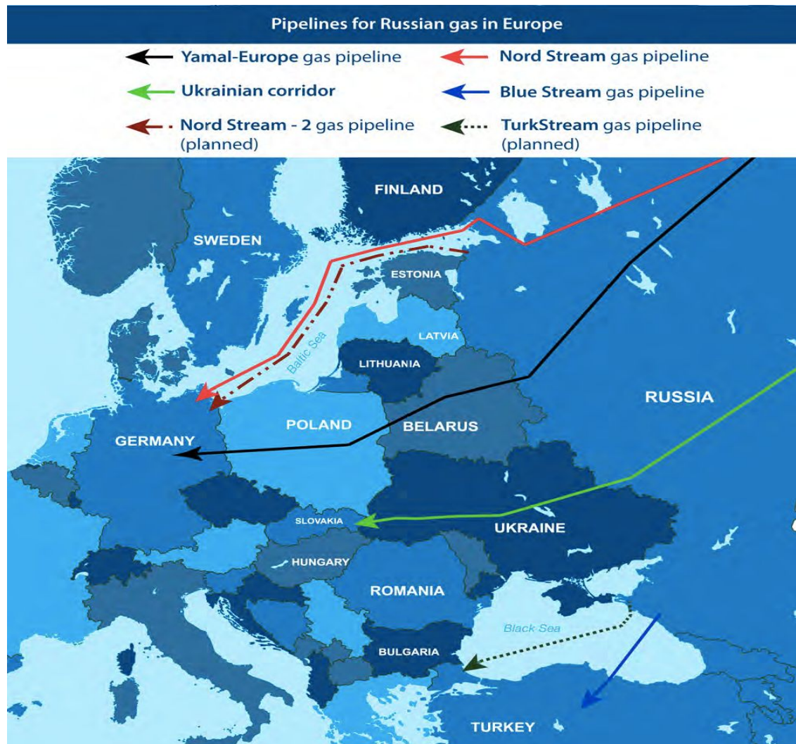
Figure 2. Pipelines for Russian gas in Europe. Source: Center for the European Reform. Available at: https://www.cer.eu/insights/nord-stream-2-more-hot-air-gas

gas delivering to the EU which means that Russia will become even less vulnerable from the transit countries.