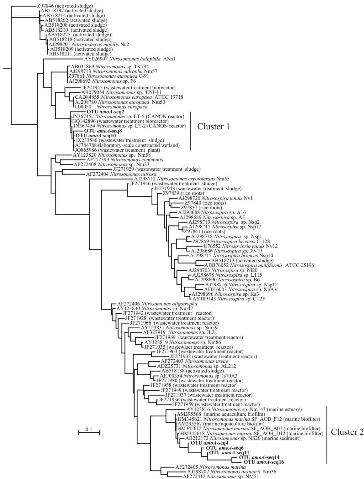
Fig. 3. Maximum-likelihood tree of amoA gene. The tree was determined using approximately 491 unambiguously aligned positions of nucleic acid amoA sequences. Each sequence from this study (in bold) is representative of clustered amoA sequences in the WWTP activated sludge with an identity of 94%. Reference sequences from GenBank database are indicated by their accession number if they correspond to uncultured organisms or by the strain name if they belong to amoA sequences from bacterial strains. The tree was constructed with RAxML ( http://www.oxfordjournals.org/content/22/21/2688.full ) using the GTRGAMMA model and an alignment made with MUSCLE ( http://www.ncbi.nlm.nih.gov/pmc/articles/PMC390337/ ). The sequence of methane monooxygenase subunit A from Methylococcus capsulatus strain Bath served as outgroup (GenBank Accession No. YP_115248). The scale bar indicates substitutions per site.