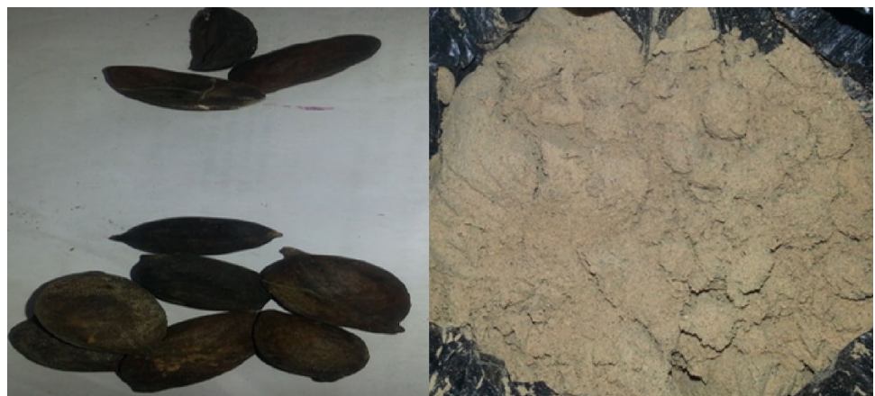
Fig. 1 Averrhoa carambola L. (Kian) fruit and its powdered form

Detarium microcarpum is particularly associated with dry savannah. It grows naturally in forests, flowers throughout the wet season and bears fruits between November and