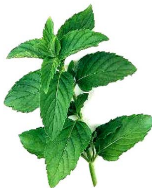
Fig. 2: Mentha spicata plant