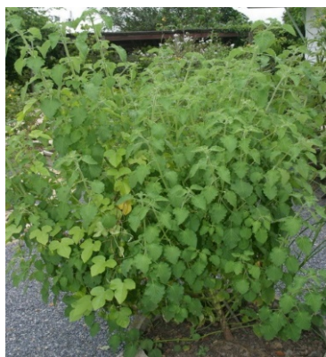
Fig. 1: Hyptis Sauveolens .

The aim of this work was to get a substitute to chemical mosquito repellents available in the market by obtaining oil extracts from three (3) local leaves through Soxhlet extraction method.