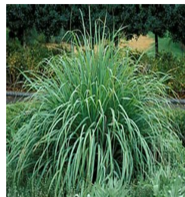
Fig. 3: Cymbopogon citratus