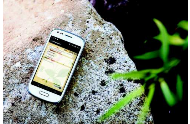
Fig. 3. Illustration of the Biodiversity application. Campus users can help to monitor fauna and flora using their smartphones. Those data help researchers to dress an up to date list of the fauna and flora.

CO2, humidity, etc... see figure 2). This project studies the use of autonomous machine learning systems coupled with the indoor environment quality expertise. This expertise concerns thermal, visual, acoustic comfort, air quality, the impact of occupants behaviours on the thermal performance of buildings, the control and optimization of energy networks, systems and buildings and the thermal and acoustic characterization of materials. The project aims at learning to optimize in real time both the well-being of users and the energy consumption of the classroom.