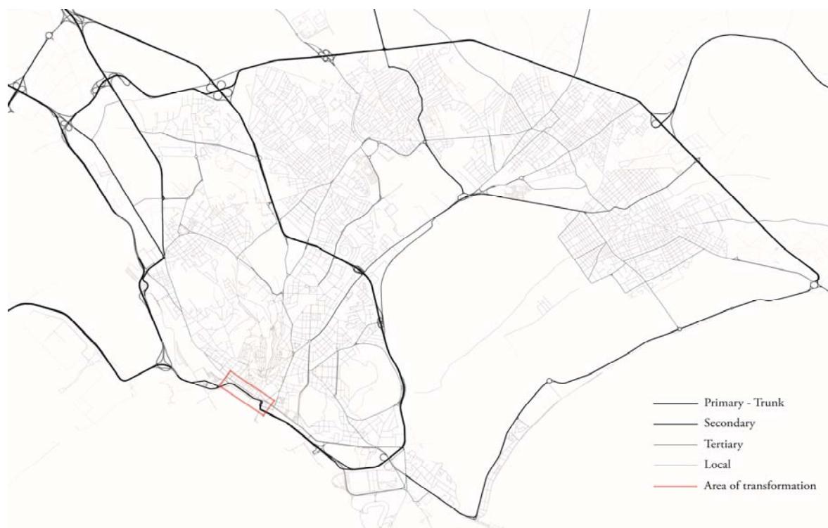
Fig.3. Configuration of the road network and classification of its routes

The proposed qualitative method can be regarded as an analytic tool, by means of which to reconstruct alterations in the structure of the road pattern produced by the pedestrianization of via Roma Lato Portici. The analysis requires to reconstruct the configurational and constitutional properties of the road layout: the network function of each element, hence its type and rank, is derived from the Open Street Map database. The analysis of the road network reveals the existence of three circuits, or rings, that constitute contiguous subsystems of strategic itineraries. Hence, a metropolitan arterial sub-network is identified, consisting of trunk roads and primary distributors and an inner sub-network, contiguous at the scale of the compact urban settlement; these two circuits include the strategic itinerary unfolding along Via Roma (Lato Porto), Via Riva di Ponente and Viale La Playa.