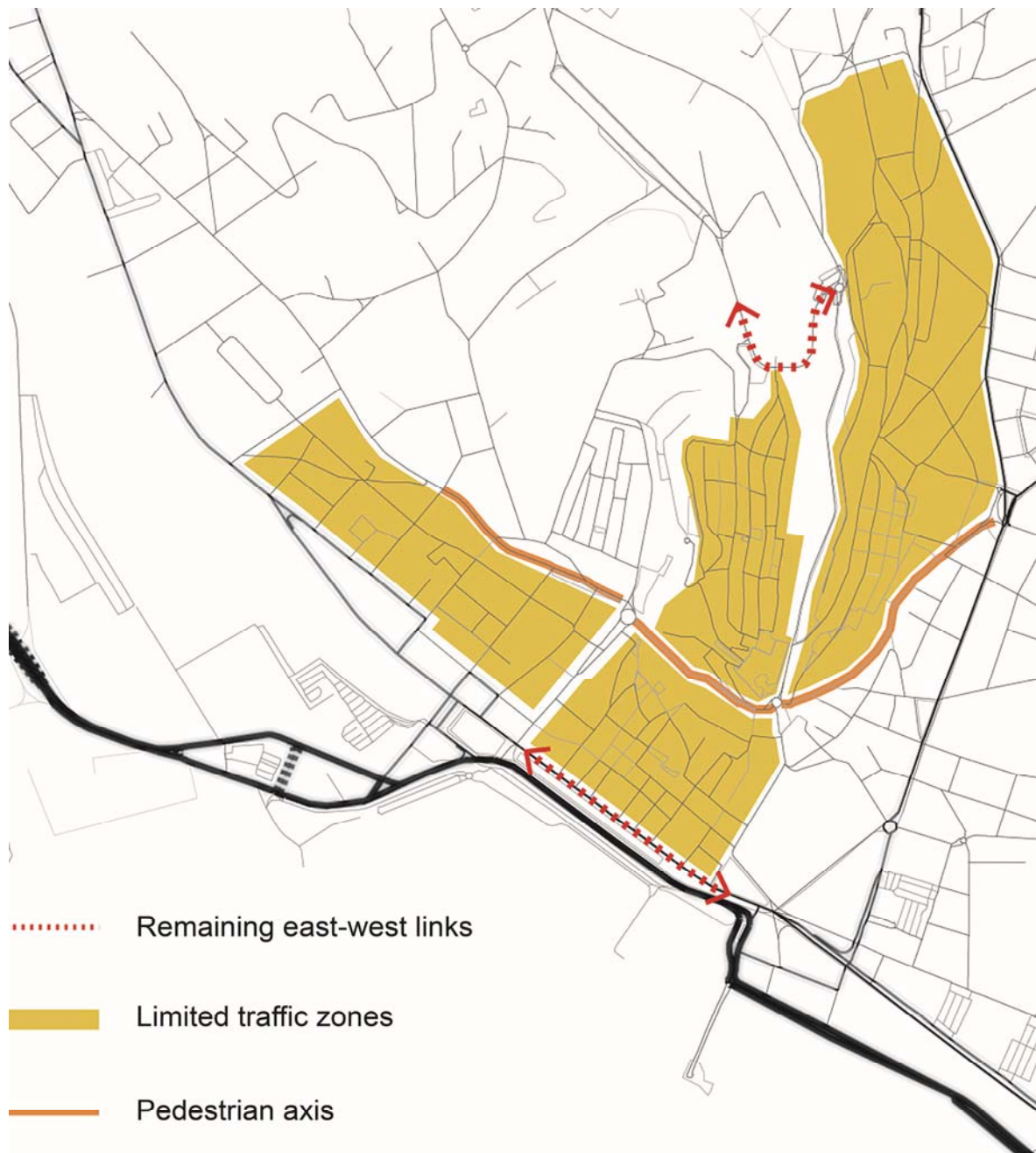
Fig. 1. Separation between parts of the urban fabric

before for such a prolonged period, resulted in numerous variations in traffic circulation and, in particular, in a significant modification of the network configuration.