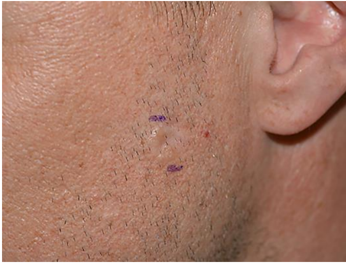
Fig. 1. Clinical picture of the tumor showing a flat, skin-colored papule with slightly pronounced and clearly demarcated borders, whitish scar-like atrophy, and small slightly shiny papules.