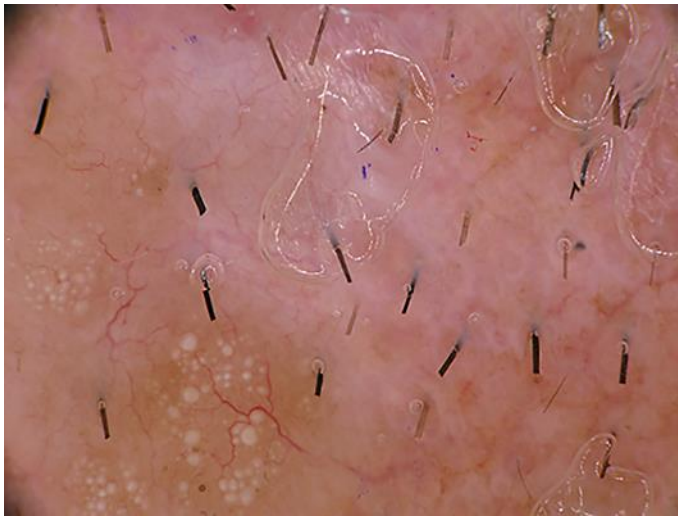
Fig. 2. Dermoscopic picture showing an ivory white background, multiple grouped keratin cysts, and arborizing telangiectasias of different caliber.