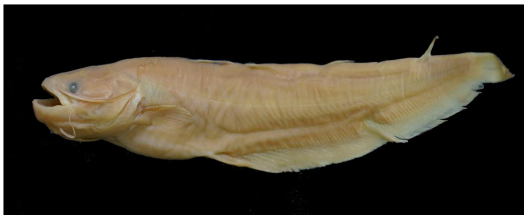
Figure 2: Lateral view of the variant of Silurus asotus .