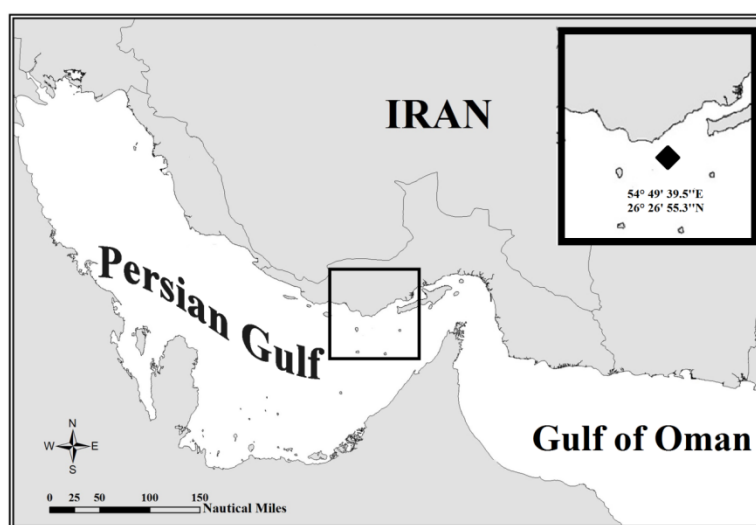
Figure1: Map of sampling location in the northern Persian Gulf.

morphometric measurements were taken using a dial caliper with an accuracy of 0.02 mm. The data were taken, and recorded based on Nateewathana (1997), Nateewathana et al. (2001) and Aungtonya et al. (2011).