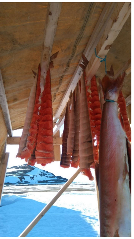
Figure 24: Pitsi (dried fish, arctic char) Photo taken June 2017.

Food sharing strengthens social relationships, and promotes cohesion, and the sharing and consumption of country food in particular is an important aspect of nutrition and health (Price, 2007; Watt-Cloutier, 2015). Inuksiutit, Inuit food or country food, food from the land such as tuktu (caribou), maktaaq (whale skin with fat), nattiq (ringed seal), kanguq (goose) and iqaluk (fish, arctic char) is regularly eaten by Ikpiarjukmiut and is fresher, more economical, and healthier than many options at the local Northern store. While enrolled in a post-secondary course and living in another Northern community, a friend from Arctic Bay claimed that she occasionally lacked focus and struggled to concentrate on her coursework. Ruth felt strongly that it was due to the absence of nattiq (ringed seal), an important food source, in her diet. As a student living outside her home community and thus separated from family members who share