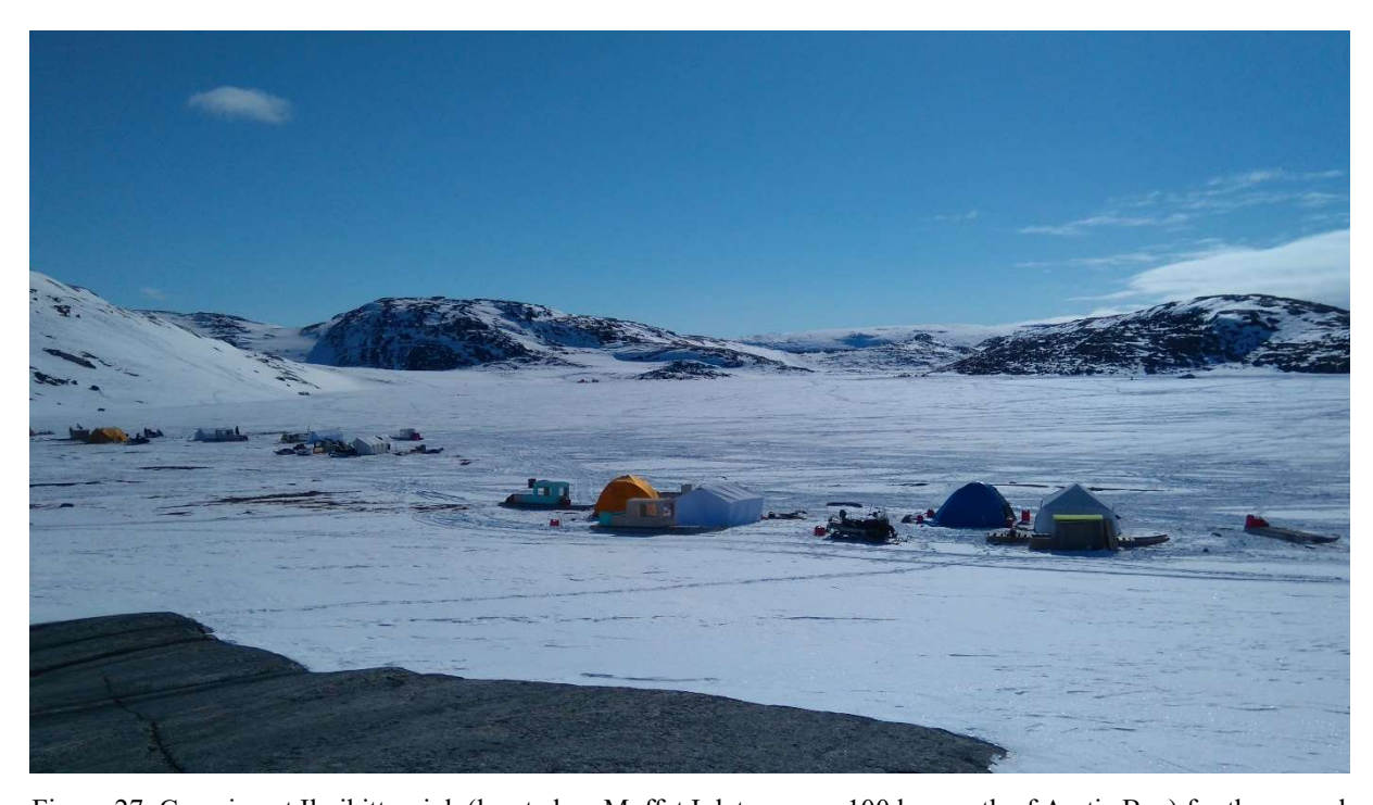
Figure 27: Camping at Ikpikittuarjuk (located on Moffet Inlet approx. 100 km south of Arctic Bay) for the annual Fishing Derby. Photo taken May 2017.

In recalling childhood activities, participants fondly shared memories of camping with family, travelling on the land, learning to hunt and fish, picking geese eggs and berries and attending Spring Camp with their classmates as part of the school's cultural program. For many,