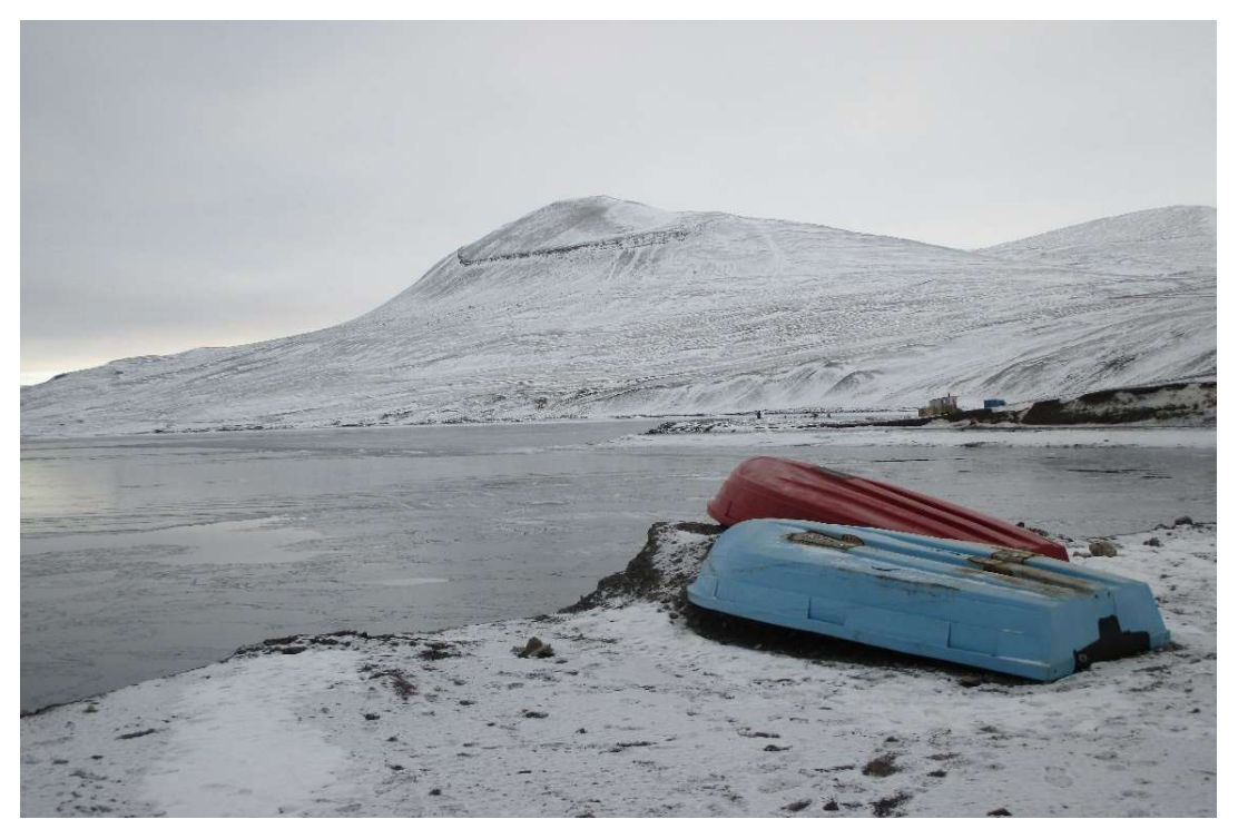
Figure 10: Shoreline of Nanisivvik. Photo taken October 2014.

Beneath the surface of a ridge on Strathcona Sound lay rich deposits of zinc, lead, and silver. Nanisivvik <sup>11</sup> which means "a place to find" (M. Allurut, personal communication, June 2017), was established as a mine and townsite between 1974 and 1976. Although a prospector aboard Captain Bernier's ship, Arctic , claimed to have 'discovered' minerals in the area as early as 1910, it was too difficult and costly to extract and ship the ore south (Harper, 1983). In 1954, two Qallunaat prospectors arrived to examine the site, hiring several Inuit from Arctic Bay to conduct mineral tests and assist with staking. A gravel highway was constructed in 1974, the longest one on Baffin Island, connecting Nanisivvik to Arctic Bay, just 32 km away. An airport offering jet service was also built in Nanisivvik. It remained the only airport in the area until a small airport was constructed near Arctic Bay in 2011.