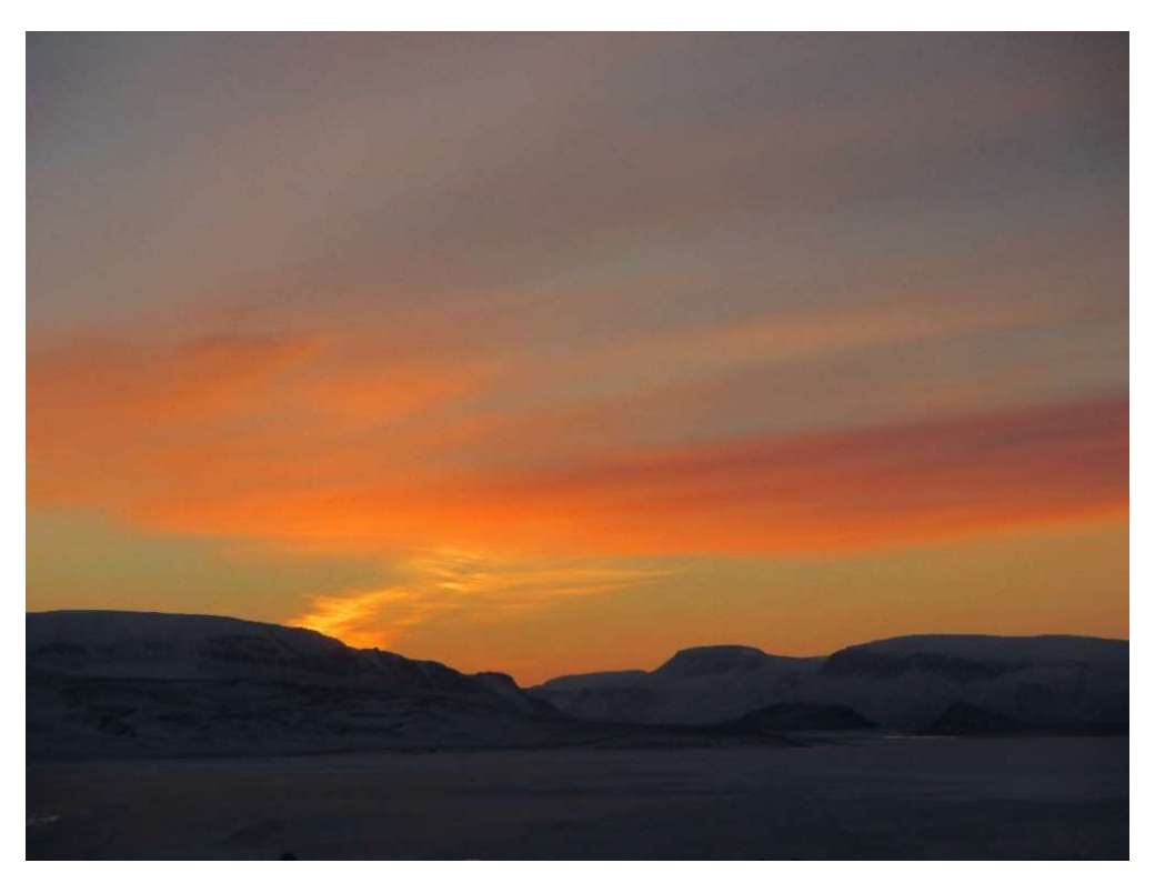
Figure 20: Sunset over the Bay (view towards Pattatalik ). Photo taken October 2014.

in Arctic Bay, being 'out on the land' implies a shift to a separate area, away from or outside the community settlement. For many, being on the land means 'coming home' (Marchand, 2014; McElroy, 2008; van Dam, 2008). Although my understandings are situated in my experiences, observations, and relationships with Inuit in a High Arctic community, I recognize that whether Inuit reside in the North or in southern urban spaces, relationships with land are foundational to Inuit Qaujimajatuqangit.<sup>45</sup>