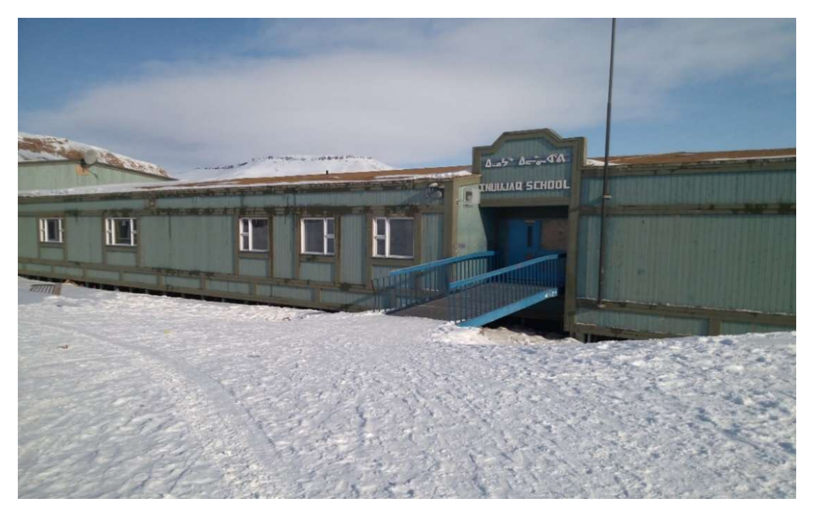
Figure 13: Inuujaq School, Arctic Bay. Photo taken May 2014.

Presently, Inuujaq School, the only school serving the community, is a large, low, green coloured building strategically positioned in the centre of the hamlet, dominating the vista of the community as one approaches from across the bay or by land. Named after one of the first residents of the community (Fieldnotes, May 2015), the current structure is the fourth building to house the school (Douglas, 1994). The K-12 school has an enrolment of approximately 235 students taught by eighteen teachers, eight of whom are Inuit. There are also three Inuit student support assistants working in the school. Although some schools in the territory have Learning Coaches who support literacy development, that position does not currently exist in Arctic Bay. Additionally, the roles of Vice-Principal and School Community Counsellor have remained vacant for some time. As with any school, there are fluctuations with Inuit and Qallunaat staffing as individuals move, take parental leaves, or pursue other employment or educational