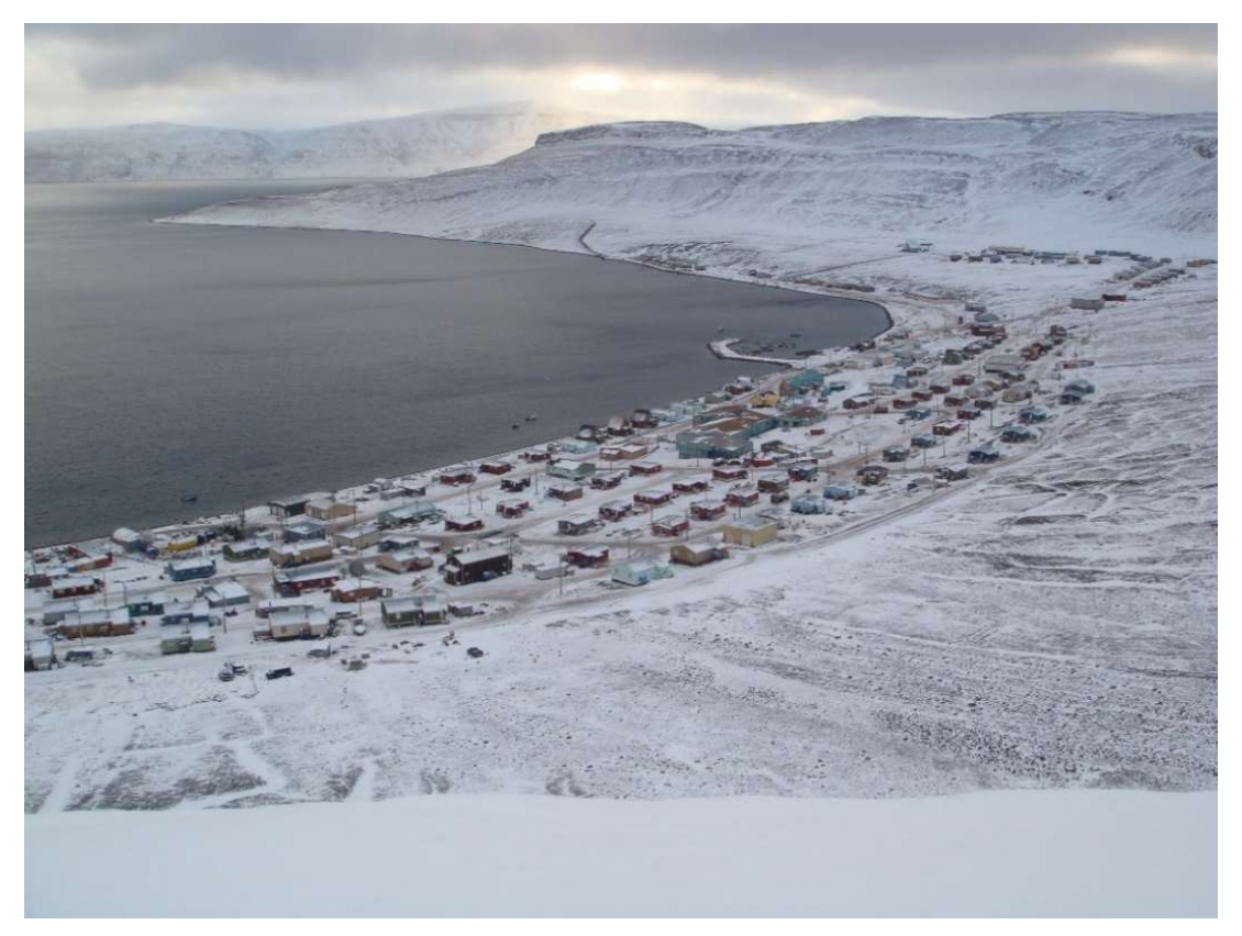
Figure 2: Arctic Bay and Uluksat Point. Photo taken October 2014.