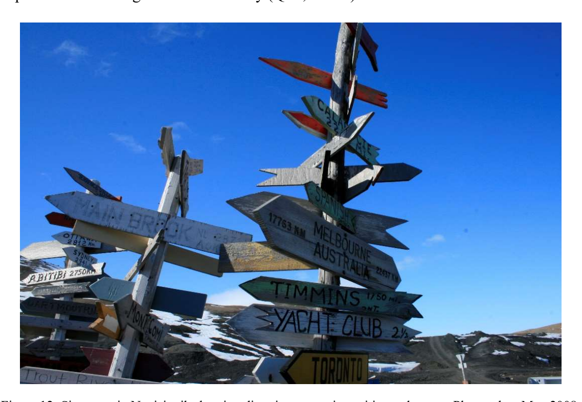
Figure 12: Signposts in Nanisivvik showing directions to various cities and towns. Photo taken May 2008.

resource development are widespread. The shipping of ore disrupted animal migration, ice conditions, and hunting practices (Fieldnotes, May 2017). Although facilities were built and more services available, most were established in the Nanisivvik townsite instead of Arctic Bay. Fortunately, given the proximity of the mine, Arctic Bay workers could travel to work, returning home at the end of each day. Greater personal income afforded by the mine meant higher standards of living including the ability to purchase new equipment and supplies to participate in the hunting economy. That said, the availability of alcohol at the Nanisivvik site had significant detrimental impacts on individuals and families in Arctic Bay (Brubacher & Associates, 2002; QIA, 2013a). Any benefits that did exist, disappeared after mine closure. Arctic Bay received hamlet status in 1976 to be better positioned to deal with the influences that the mine and related development were having on the community (QIA, 2013a).