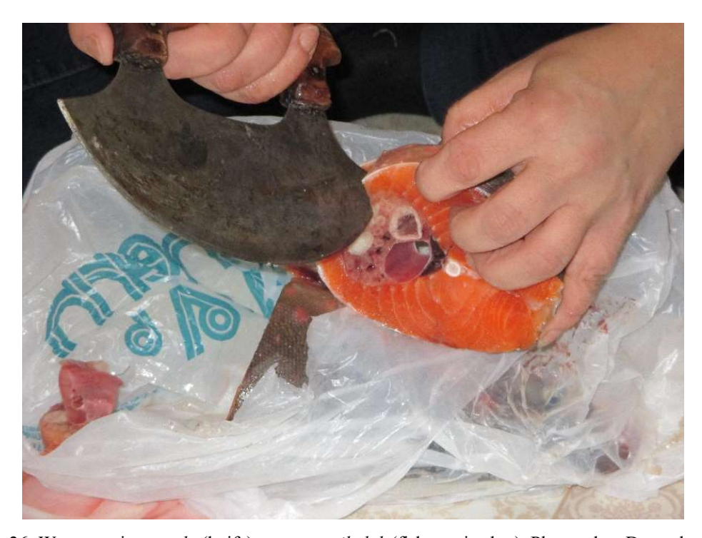
Figure 26: Woman using an ulu (knife) to prepare ikaluk (fish, arctic char). Photo taken December 2014.

mother needed to eat country food to help with her exhaustion but also to soothe her so that she could rest and feel better. In response to the Facebook post, reaffirming Arctic Bay as an interdependent community, a family member dropped off some nattiq (ringed seal) which was prepared and shared among our group. Following our meal of nattiq uujuq (boiled seal), I became aware of a palpable sense of relief and confidence among family that the consumed country food would settle Ningiuk (grandmother or older woman) (Fieldnotes December 4, 2014). While the country food provided nutrition, and contributed to her physical health, it seemed that her emotional, social, and spiritual health lifted as well. Arguably, the social gathering of family and friends to prepare and share food was important in addressing her personal and emotional needs. As an elderly woman who spent most of her life living on the land, the consumption of country food offers a spiritual connection to land and her traditional life, perhaps strengthens her cultural identity, and reaffirms Inuit interconnected relationships with animals and hunting (Borré, 1994).