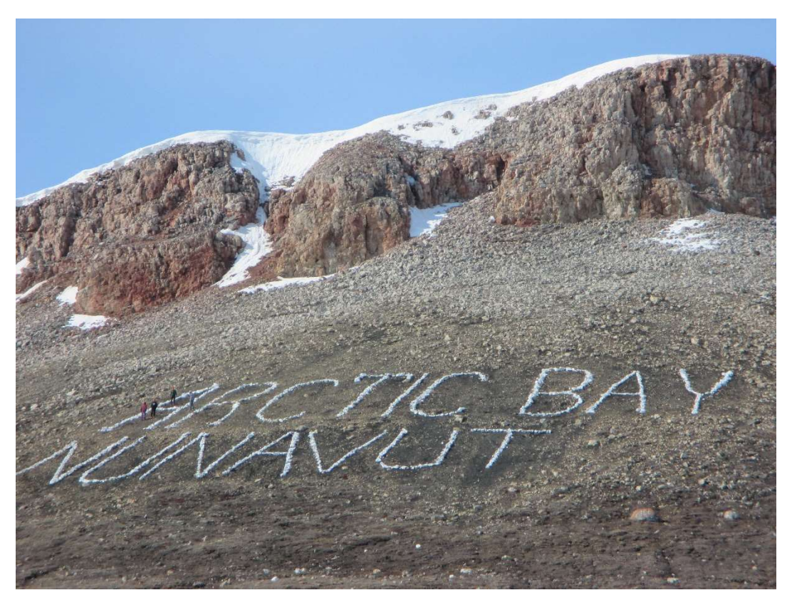
Figure 6: Inuit youth climbing the hills which bear the community name. Photo taken June 2015.

According to Kuppaq, an Elder from Arctic Bay, "there have always been people living here; it was one of the camps. People would come and stay for a while and then move on to another camp" (as cited in Innuksuk & Cowan, 1976, p. 53). However, for the most part, it remained a temporary camp until the Hudson's Bay Company (HBC) established a post there in 1936. In fact, the first HBC trading post, named Taqqik (the moon) was set up in 1926 but closed the following year after those involved learned that Arctic Bay was within the boundaries of the Arctic Islands Game Preserve (Dawson, 1980; QIA, 2013a; Rowley, 2005). The preserve was created in 1926 to "protect the areas reserved as hunting and trapping preserves for the sole use of the Aboriginal population" (Cavell & Noakes, 2010, p. 243) and advance Canadian sovereignty. The HBC trading post reopened in 1936 when the federal government relaxed the game preserve restrictions (Innuksuk & Cowan, 1976; QIA, 2013a).