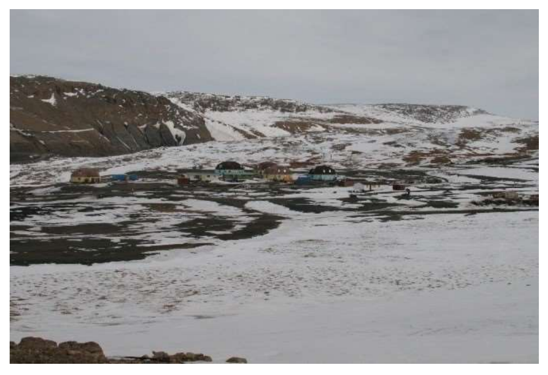
Figure 11: Some of the last vestiges of the town of Nanisivvik. Photo taken May 2008.

Despite the promise of 60% Inuit employment, in 1974 out of 100 workers on site, between 20 and 25 were Inuit (Indian and Northern Affairs, 1975). Although documentation produced by Indian and Northern Affairs (1975) suggests that "many talks have taken place with the people of Arctic Bay" (p. 5) and that the "people of Arctic Bay were told what was happening and why" (p. 9), the extensive research conducted as part of the Qikiqtani 12 Truth Commission reveals that Arctic Bay residents were disappointed with the lack of consultation. In fact, accounts of consultative efforts undertaken with the community reveal only superficial and symbolic involvement (Fieldnotes, May 2017; Gibson, 1978; QIA, 2013a).