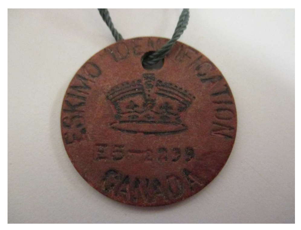
Figure 16: E-disk belonging to a member of the Qamanirq family in Arctic Bay. Photo taken with permission December 2014.

RCMP, health professionals, educators, and government officials used the numbers in place of Inuit names to administer services and enumerate Inuit. Mini Aodla Freeman, an Inuk from Cape Hope Island in James Bay, Nunavut remembers the RCMP visiting: