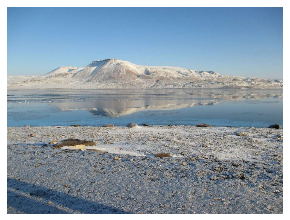
Figure 19: King George V Mountain (Iniksaaluk), Arctic Bay. Photo taken October 2014.