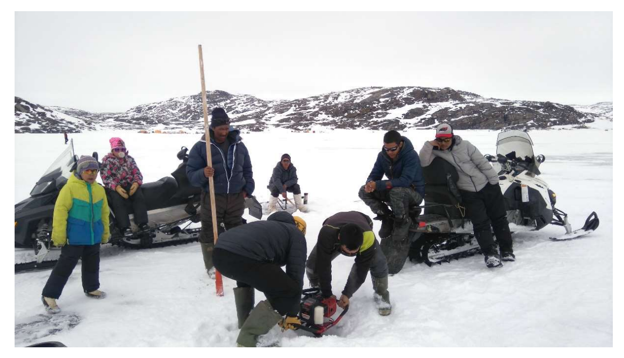
Figure 21: Inuit men drilling hole for ice fishing at the Fishing Derby, Ikpikittuarjuk (approximately 100 km south of Arctic Bay). Photo taken May 2017.

acknowledge the "primordial relationship" Inuit have with their lands to support effective learning and student success.