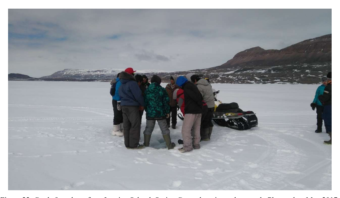
Figure 22: Grade 9 students from Inuujaq School. Spring Camp, learning to hunt seal. Photo taken May 2017.

The school-organized spring camping experiences are important in ensuring a sense of continuity in the context of contemporary community life. Inuit cultural tradition is found in the landscape and in the patterns of social relationships (Fletcher & Denham, 2008). As the land is extolled with shared values, knowledge and histories, Inuit strengths, traditions, and resilience are enacted and embodied in experiences and connections with land (Styres, 2011; Styres et al., 2013). In addition to viewing the camping opportunities as a cultural imperative for youth who can continue to observe and practice traditional skills passed down through generations, Leslie imparts cultural pride in the ongoing teaching and learning of traditional practices. The affect (it "gets me...it makes me smile, yeah") of witnessing young people engaging with the land and learning with Elders is inspiring and points to the land as an energizing force of teaching and learning.