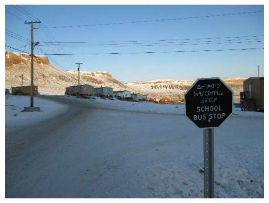
Figure 15: School bus stop sign, Arctic Bay. Photo taken October 2014.

years and aims to provide healthy breakfast options, including cereal, fruit, and yogurt to students. A large well-resourced library is immediately visible upon entrance to the main doors of the school. The Ikpiarjuk Library had previously been considered a community library, open to members of the public. However, a recent decision to close its doors to the community due to security concerns, a lack of classroom space for the school, and perceived underuse has been a contentious issue in the community (Fieldnotes, May 6, 2014). Regular school assemblies are held to issue attendance awards and acknowledge student achievements. The school gymnasium hosts community feasts, sports practices, extra-curricular activities, and other local events.