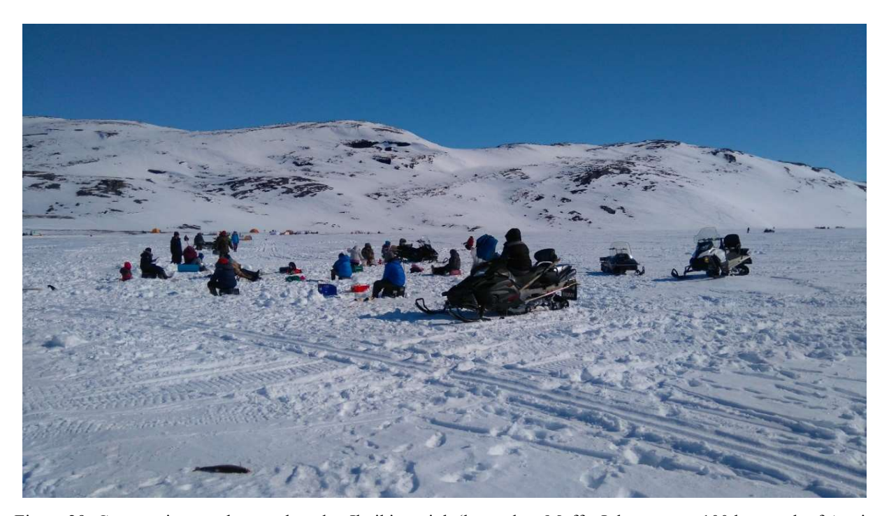
Figure 29: Community members gathered at Ikpikittuarjuk (located on Moffet Inlet approx. 100 km south of Arctic Bay) for the annual Fishing Derby. Photo taken May 2017.

The contexts of many conversations involved personal and family interactions with land, growing up, and schooling experiences. As such, interview participants often spoke in past tense, recalling childhood memories, events, family activities, and school days. Despite some modern challenges previously mentioned, many families continue to camp, hunt, fish, travel and gather together on the land.