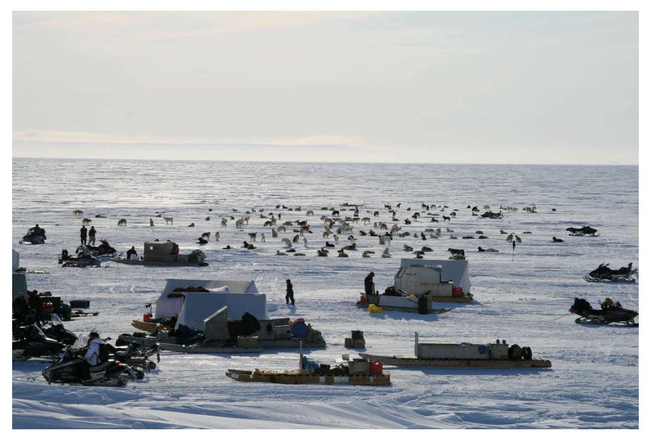
Figure 28: Campsite near Arctic Bay for Nunavut Quest (Annual Dog Team Race). Photo Taken April 2008.

"I remember going out with my class to learn how to seal hunt out on the ice. I think doing these sorts of activities bring the teacher and students closer."