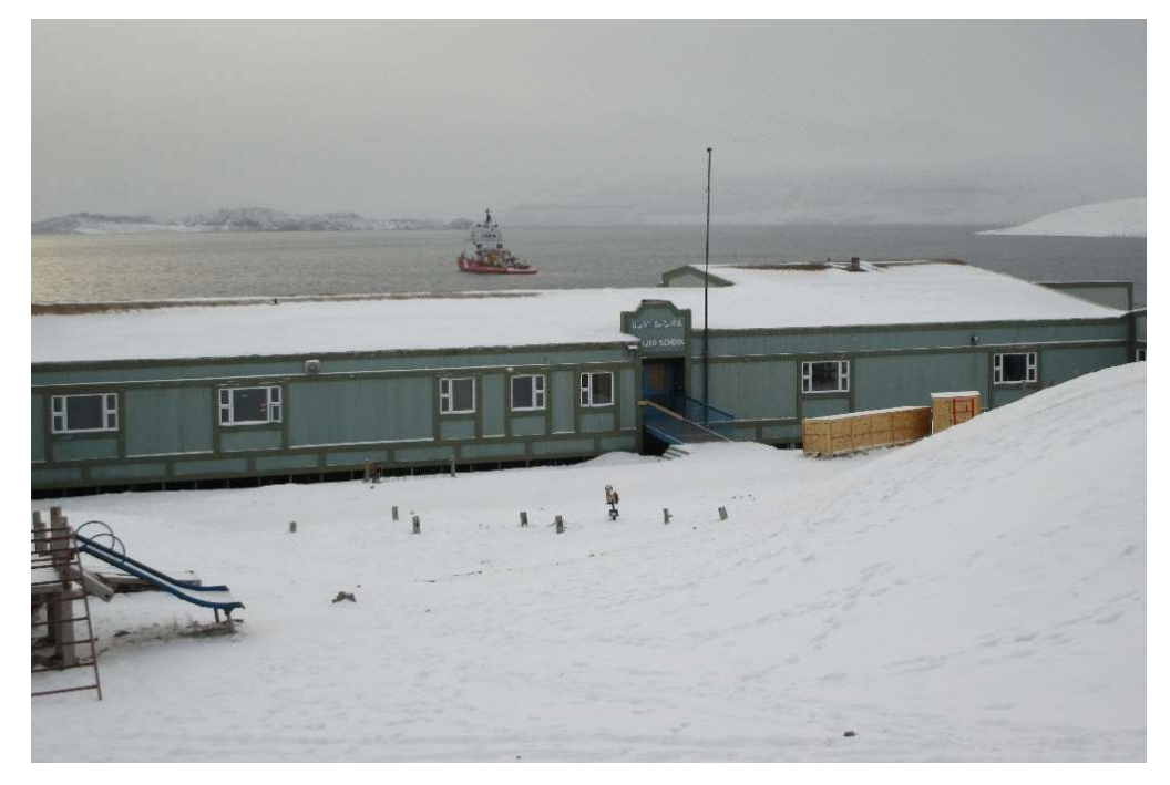
Figure 14: Inuujaq School (Coast Guard ship in background). Photo taken September 2014.

opportunities. Securing substitute teaching positions remains difficult in the community (Fieldnotes, May 2017).