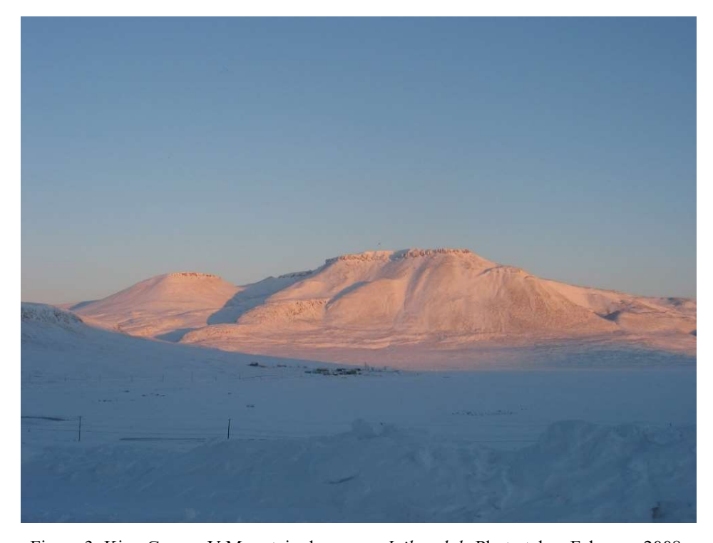
Figure 3: King George V Mountain, known as Iniksaaluk. Photo taken February 2008.

and protect the mouth of the bay. The enumerated population is approximately 868, 96% of whom identify as Inuit (Statistics Canada, 2016) and the first language spoken is Inuktitut.<sup>8</sup>