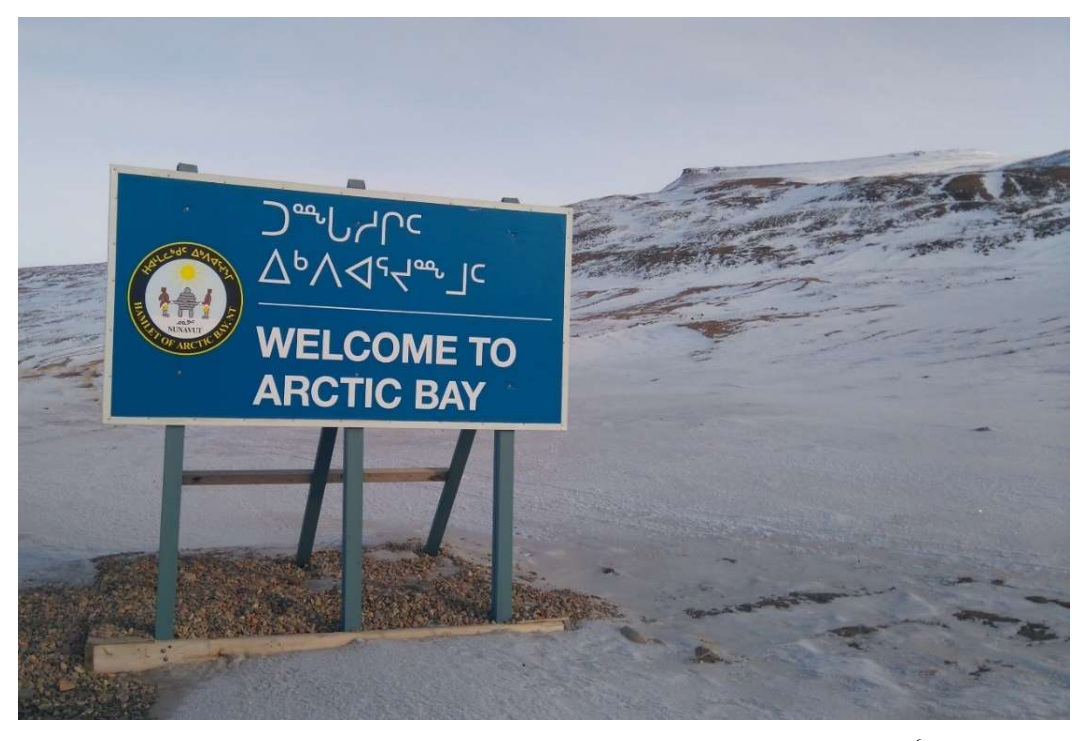
Figure 1: Welcome to Arctic Bay ( Ikpiarjuk ). Photo taken April 2017.<sup>6</sup>

Arctic Bay,<sup>7</sup> is a community nestled on a small bay located on northern Baffin Island in the Inuit territory of Nunavut. Ikpiarjuk is the Inuktitut name, often used by the local Inuit population. Although commonly understood to mean 'the pocket', referring to the high glaciated hills that surround the almost landlocked bay, Ikpiarjuk also means 'a short trip over land' so named because of the community's proximity to Victor Bay, also known as Pamiuja (M. Allurut,