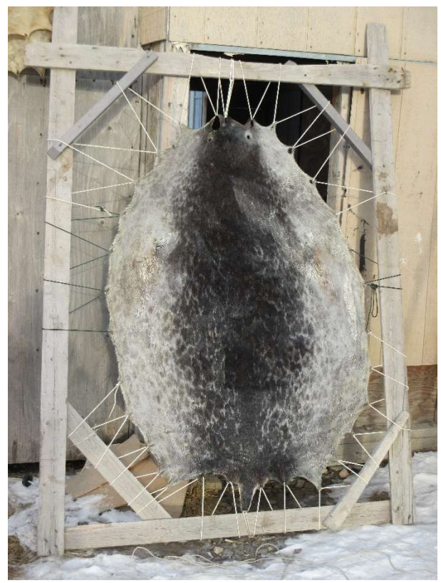
Figure 23: Qisik (a seal skin) stretched to dry. Photo taken October 2014.