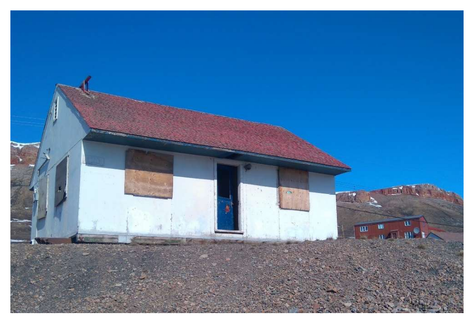
Figure 8: The original Weather Station (built in the 1940s), which later became a RCMP detachment is one of the oldest buildings in Arctic Bay. Photo taken June 2017. Sadly, it was destroyed by fire in September 2017.

representatives of the HBC, the Catholic missionaries, and employees of the weather station, which was constructed during World War II but closed in 1958. The RCMP Officer was based in Pond Inlet and made annual trips to Arctic Bay (Hinds, 1968).