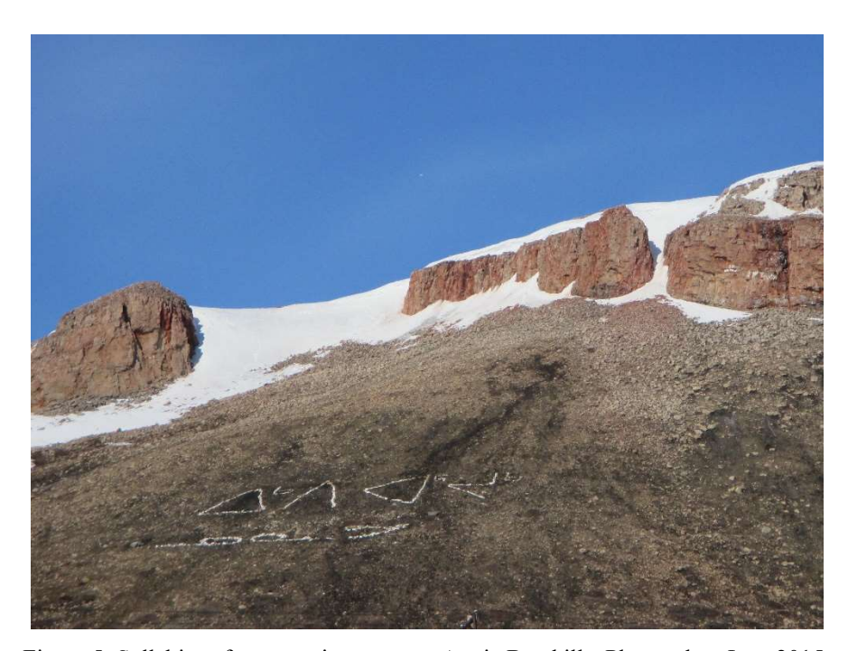
Figure 5: Syllabics of community name on Arctic Bay hills. Photo taken June 2015.