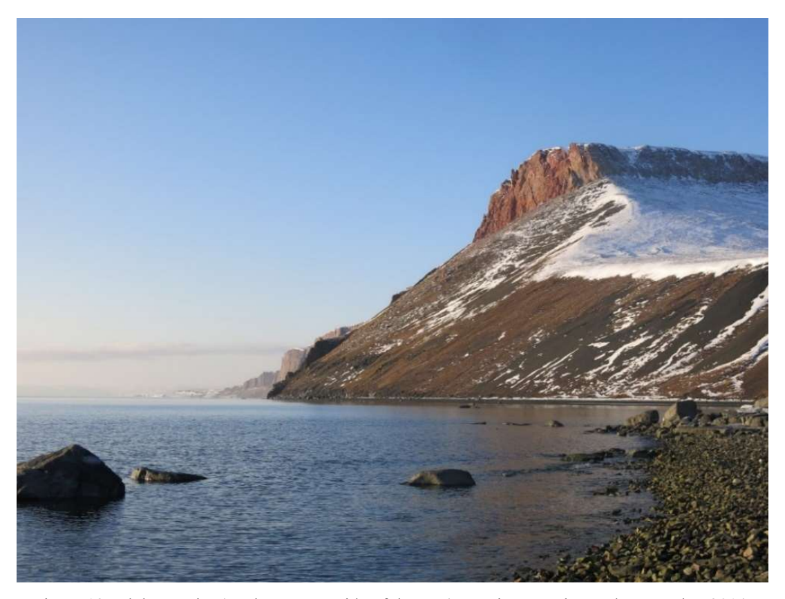
Figure 18: Uluksat Point (on the western side of the Bay), Arctic Bay. Photo taken October 2014.

Throughout this dissertation, land refers to the geographical land, ice, water, wind, sky, mountains, plants and animals, but also the spiritual, dynamic, and emotional aspects of land which have sustained Inuit since time immemorial. More than providing sources of food, shelter, and clothing, land is a source of knowledge, strength, culture, and wellbeing. Inuit are physically and spiritually part of the land and believe that their relationships and knowledge also guide the land as "the earth is shaped by people's thoughts" (Margaret Uyauperk Aniksak, as cited in Bennett & Rowley, 2004, p. 119). My understanding is that for Inuit, the living land is largely a set of relationships that are constantly changing, evolving, and shifting. Land is complex, relational, and all-embracing, encompassing culture, dreams, thoughts, values and beliefs (Collignon, 2006). The Inuit regard "the individual as an interactive constituent of the