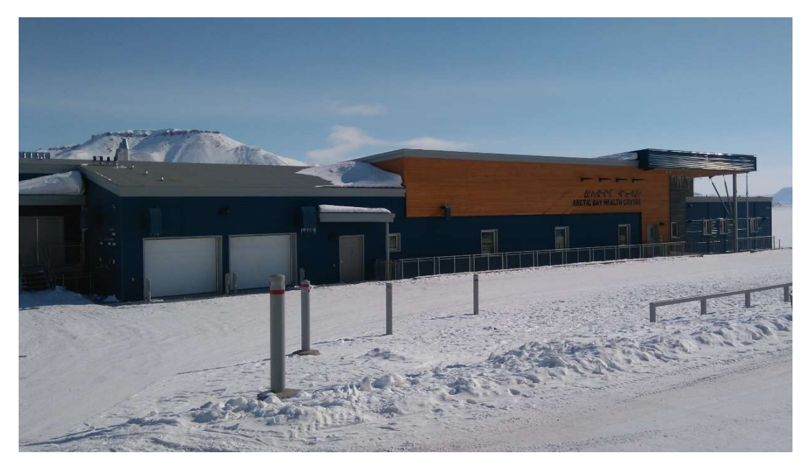
Figure 9: Arctic Bay Health Centre. Photo taken April 2017.

patrols offered limited health services to Inuit. A newly built, modern Health Centre was officially opened in Arctic Bay in September 2017.