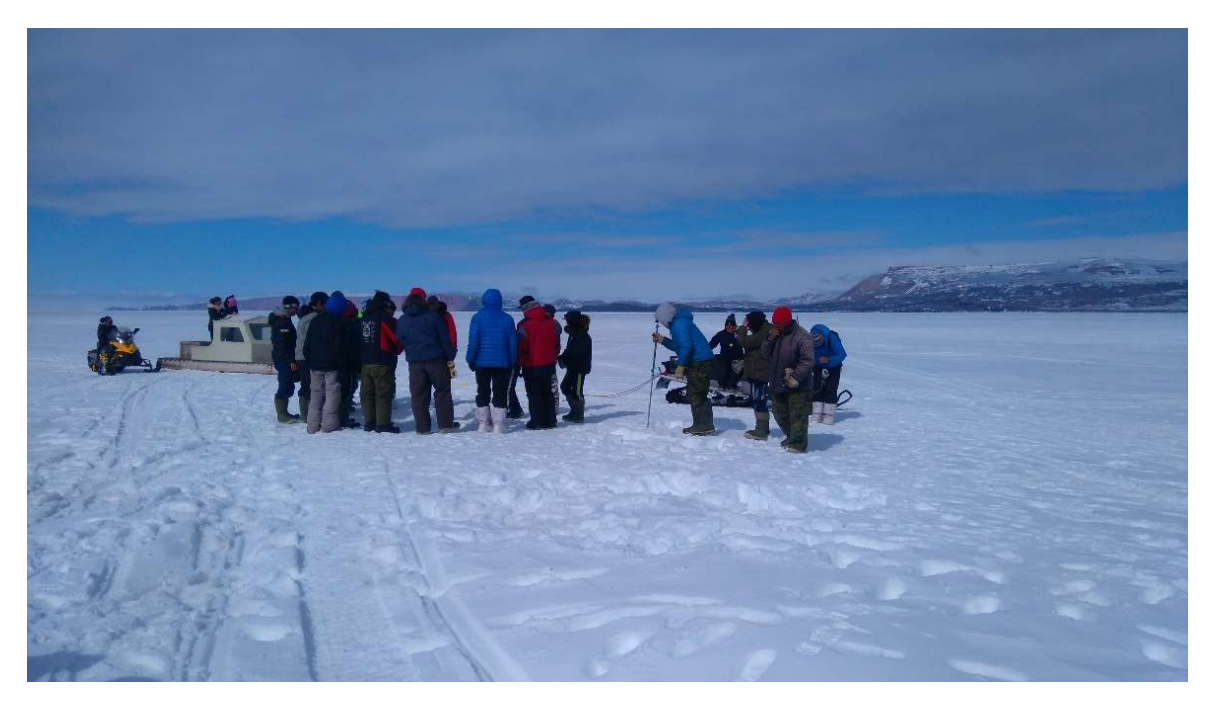
Figure 31: Grade 9 students from Inuujaq School. Spring Camp, learning to hunt seal. Photo taken May 2017.

nourishing relationships with land, and enriching students' educational experiences. The repeated appeals to incorporate learning on, learning from, and learning with the land in schooling reaffirms what Inuit have been expressing for decades – the need for schooling to reflect Inuit culture and practices. Perhaps not surprisingly, the comments made in interviews were echoed in informal conversations with Inuit friends around kitchen tables and in my observations, and experiences both as a teacher and researcher with Inuit out on their land.