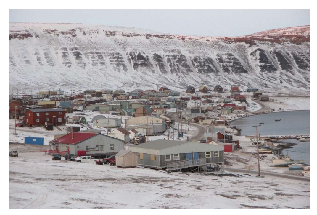
Figure 7: Start of winter season, Arctic Bay. Photo taken September 2014.

Between 1930 and 1960 semi-migratory camps followed the seasonal cycle of resources, including trips to caribou grounds in the summer. In 1936, the HBC moved several families to Arctic Bay following the closure of a post at Dundas Harbour ( Talluruti ) on Devon Island ( Tatlurutiti ). Two years prior, with the support of the federal government, the HBC had relocated Inuit 'volunteers' from Pangnirtung, Cape Dorset ( Kinngait ), and Pond Inlet ( Mittimatalik ) to Devon Island with the intention of establishing a new trading post. Despite appeals to be sent home, Inuit from Cape Dorset and Pond Inlet were moved to Arctic Bay<sup>9</sup> (Marcus, 1995; McElroy, 2008; QIA, 2013a; Tester & Kulchyski, 1994). Throughout the 1950s, Inuit family groups lived in permanent camps in the area surrounding the present community of Arctic Bay due to favourable weather and hunting conditions near Admiralty Inlet. Arctic Bay remained, for the most part, an area primarily inhabited by a few Qallunaat including