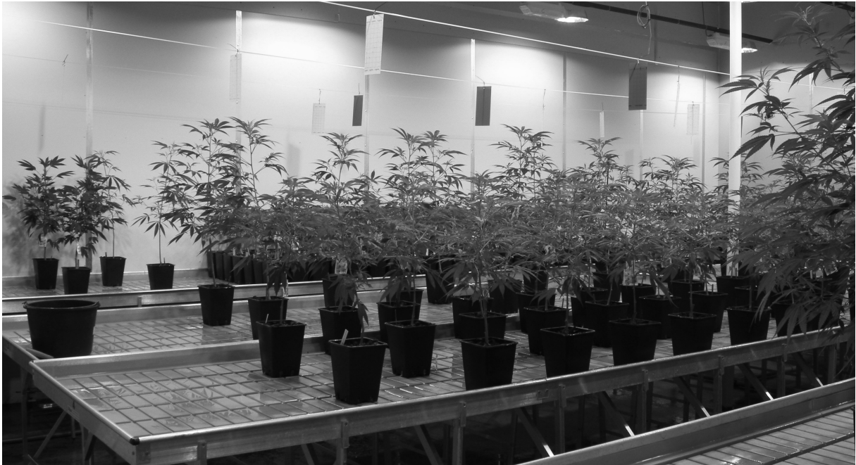
Figure S3. Room for vegetative growth at Bedrocan BV