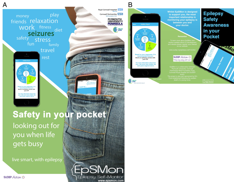
Figure 2 (A and B) Epilepsy self-monitor mobile phone app—poster and flier.

were clearly promising. 26 Most available devices detect movement and/or physiological changes that occur before or during a seizure such as altered blood oxygen levels, heart rate changes, electrical activity in muscles and changes in galvanic skin resistance. Whether we can call seizure-alert dogs a ‘device’ is debatable.