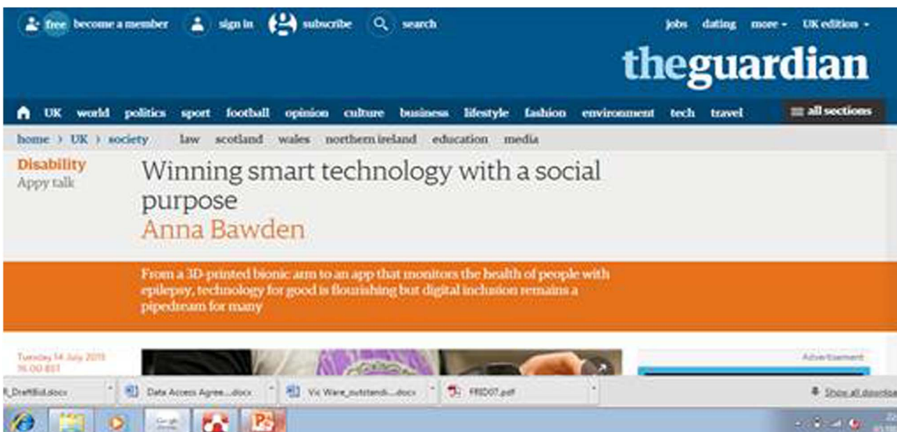
Figure 3 The Guardian newspaper review—highlighting the potential impact of technology.

movement and absence of movement. While weight and sleep movement adjustments can be made, seizure detection rates are variable, with the most successful devices picking up 89% of tonic-clonic seizures, 27 although one study failed to detect any seizures. Specificity is poor, with frequent false positives, so disrupting sleep of both carers and patients. As with all sensor devices for epilepsy, they also raise issues of individual privacy. Nonetheless, these remain the most popular among parents because of their simplicity.