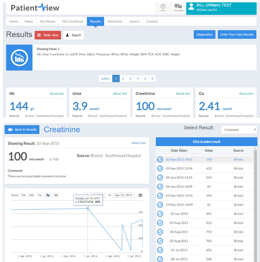
Fig. 2 PatientView example screens (adult test patient).