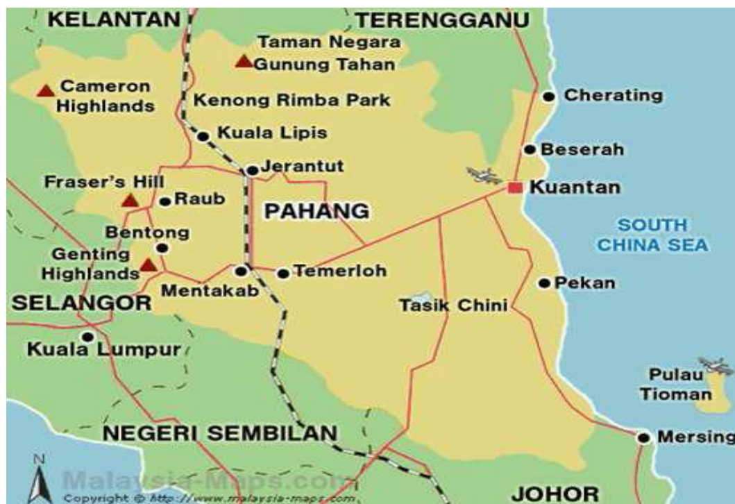
Figure 1: Map of Pahang state, Peninsular Malaysia

According to the DoA Malaysia, of the total national (re-)certifications of 313 in 2013, durian comprised the second largest number of certifications after rice. Since our focus in this study was FFV, we chose durian as the target crop for this research. As of July 2013 there were 21 certified durian farms in Malaysia, all of whom concentrated in Pahang state. Out of them, 19 farms were surveyed. Two certified farms were excluded from this research as they were DoA experimental farms operating on the public basis. Certified farms were contacted for interview with assistance by local DoA officers and using the local official DoA directory of MyGAP certifications for durian in Raub district and Bentong district. For the purpose of comparison, 57 uncertified durian farms were also surveyed. Reflecting the regional pattern of durian production in the state of Pahang, the majority of farms surveyed were located in Raub district, the most prosperous durian production district in Malaysia, 110 km from the Malaysian capital of Kuala Lumpur and 265 km from Pahang's capital of Kuantan. In addition, one certified and three uncertified farms were located in Bentong district (Figure 1).