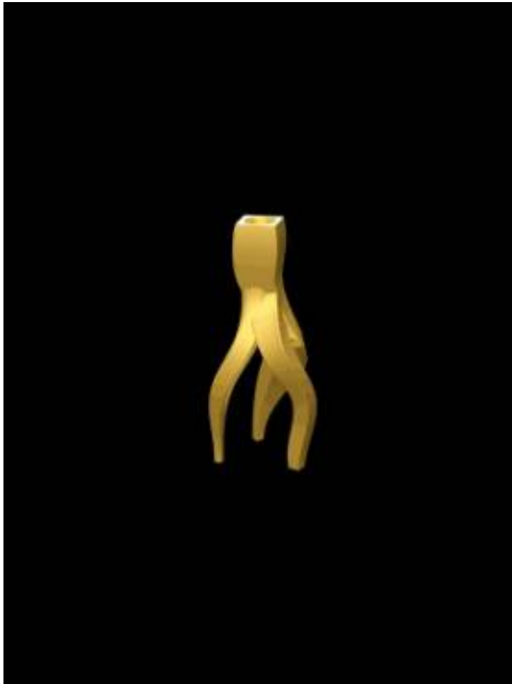
Fig 2: 'Twist' candlestick – CTRL + click to play movie

As an example of the second approach, a light fitting was designed which took the existing form of a light bulb, but with a solid metal body. Instead, the light source is a series of high intensity white Light Emitting Diodes (LED's) mounted in the ends of 'tentacles' which appear to grow at random from the bulb form. The end of each 'tentacle' is dimensionally constrained to accept an LED and the direction in which the LED points is restricted to certain angles from the vertical (to avoid glare). Three distinct characters of 'tentacle' have been designed;