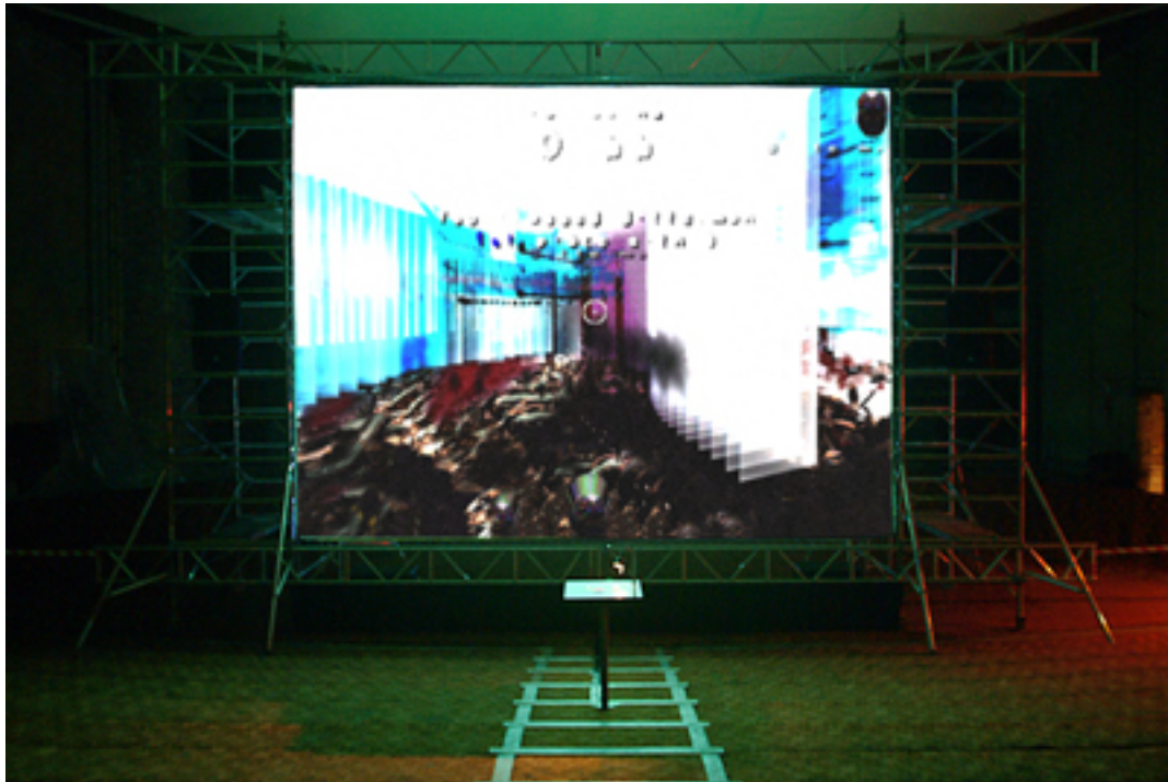
Fig 3: QQQ Installation – CTRL + click to play movie

As an installation, a 1960's cinema, unused and semi-derelict since 1980, provides a unique venue for QQQ - a blacked out environment where the abstracted death matches hover in the space where the old screen once was. The endless audio crunch of gunshots and footsteps echoes around the empty space. Users can interact with a modified keyboard, stripped of all function except the ability to direct the action.