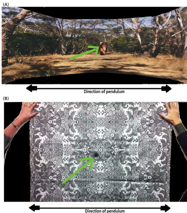
Figure 2. (A) Photograph of Pulfrich experimental test material at Moorfields Eye Hospital. A coloured jungle scene with a monkey (green arrow, still on this photograph) is shown. (B) Photograph of Pulfrich experiment at VU Medical Centre Amsterdam. A black and white tablecloth is shown with a swinging black ball (green arrow, in motion giving impression of a blur on this photograph).

Appropriate refractive correction was worn. The pendulum was a monkey face 16 in London and a plain black ball in Amsterdam. Pulfrich-positive patients were identified as those who reported a circular or rotational movement of the pendulum