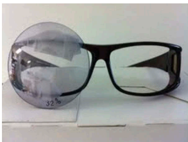
Figure 3. Prototype of spectacles for the Pulfrich phenomenon.

while in their habitual visual state, as opposed to a veridical linear movement.