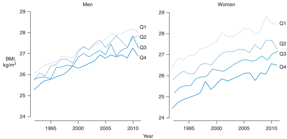
Fig. 1 English mean BMI by height quartile from 1992 to 2011. Left: men; right: women. Q1 to Q4 as Quartile 1 (shortest) to Quartile 4 (tallest).