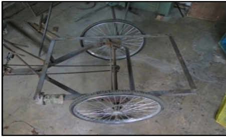
Table 1. Fabrication process of the Mobile fish vending Unit.

A tricycle was procured from the local market and the carriage holding frame was fabricated at the rear end of the tricycle as shown in the picture. The final fish vending carriage was installed on this frame.