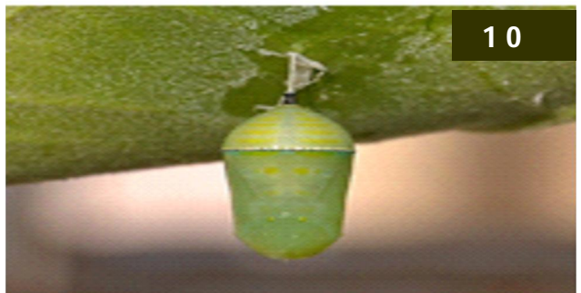
Figs.1-10. Immature stages of Danaus chrysippus chrysippus (Linnaeus). 1. Adult, 2. Egg, 3. Eggs in cluster, 4. Egg on upper side of leaf, 5. 1 st Instar larva, 6. 2 nd Instar larva, 7. 3 rd Instar larva, 8. 4 th Instar larva, 9. 5 th Instar larva and 10. Pupa.