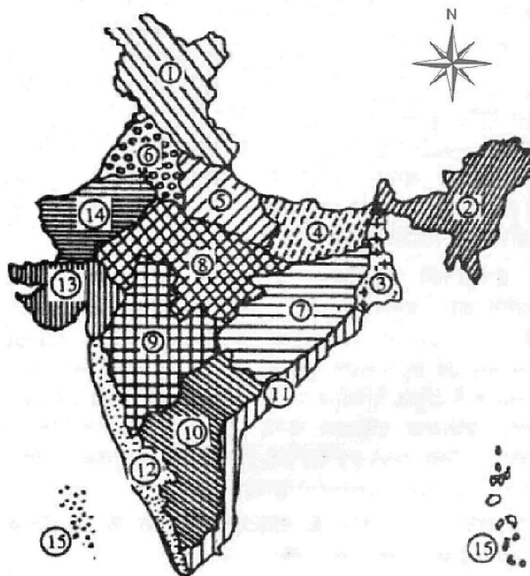
Fig. 2. Study area: Agro-climatic Regions (ACR) of India .

a consistent value of VCI with no indication of drought development in any of the study year. Two spans of drought period can be seen to exist in region 4 (Fig. 3, 4. ACR) ranging from October 2004 to May 2005 and November 2005 to July 2006. Region 5 (Fig. 3, 5. ACR) shows a very good trend of VCI values with a smooth variation throughout the study period and no indication of drought. Region 6 (6. ACR) and 7 (7. ACR) shows a similar variation a VCI index with a single drought year occurring during October 2004 to 2005 October. A relatively inconsistent variation of VCI values was seen for Region 8 (Fig. 3, 8. ACR). However, no drought conditions were seen. Region 9 (Fig. 3, 9. ACR) shows a strong pattern of VCI index variation with very high value of index for all the years. Most of the values varied between 75 per cent and 100 per cent showing good vegetative growth period. In Region 11 (Fig. 3, 11. ACR) the VCI index value was seen to stay below 40 per cent value during the period 2006-2007 indicating the development of moderate to severe drought conditions.