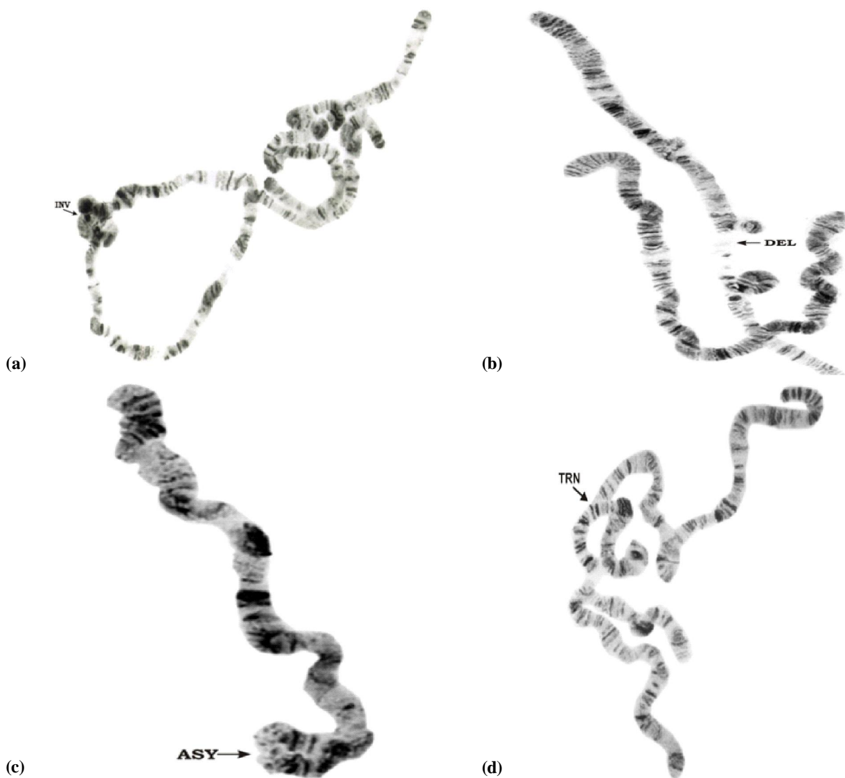
Fig. 2. Aberrations in the polytene chromosomes of An. stephensi treated with methyl parathion (a) Inversion (INV) in chromosomal arm 2R. (b) Deletion (DEL) in chromosomal arm 2L. (c) X-chromosome with terminal asynapsis (ASY). (d) Translocation (TRN) of unidentified chromosome into 2R.

the multistranded nature of polytene chromosomes (Evans, 1977; Jain and Sarbhoy, 1988). In addition to chromosomal mutations, some of the earlier studies also show that propoxur significantly increased the chromosomal aberrations in the bone marrow cells of mice (Agrawal, 1999; Siroki et al. , 2001). In a similar set of investigations Lin et al. (2007) also reported the induction of different types of chromosomal aberrations which also included sister chromatid exchanges in the Chinese