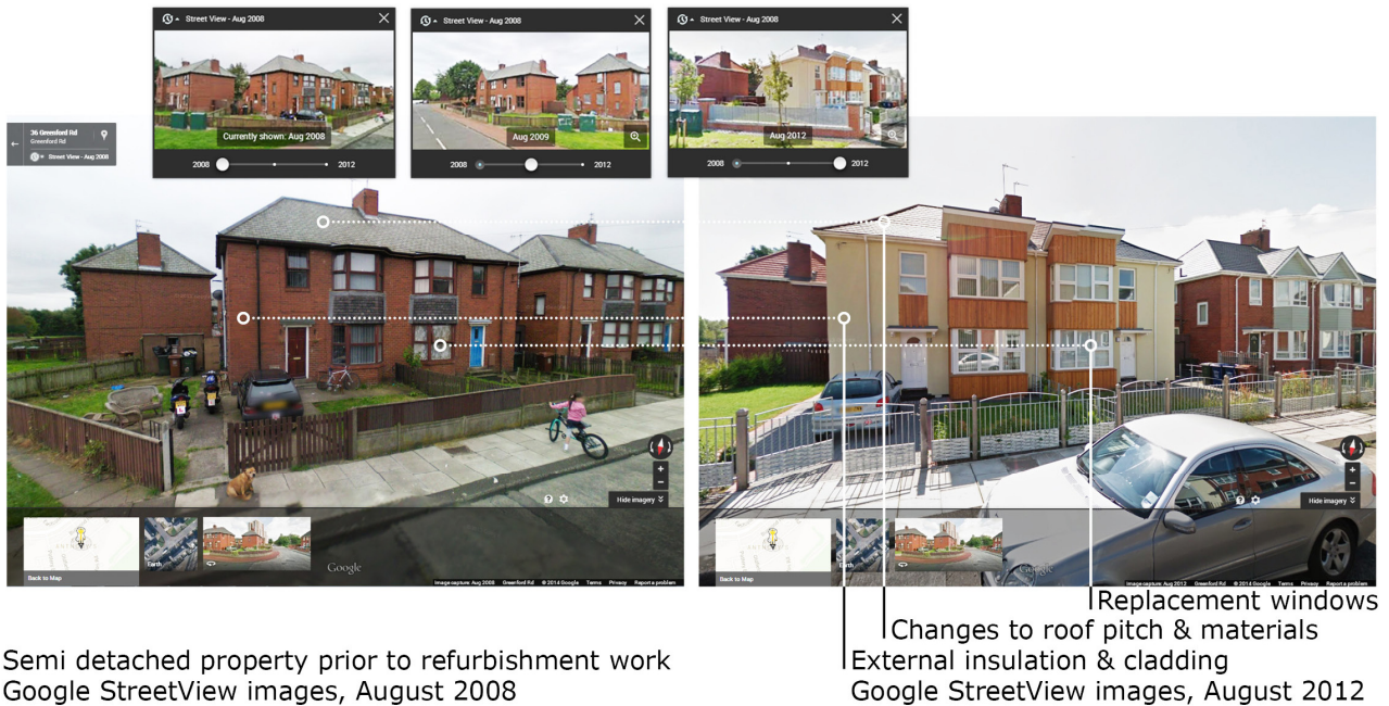
Figure 1: Potential data from historical Google StreetView for a demonstration low energy retrofit property, Newcastle upon Tyne

Figure 1 above highlights the basic information available in Google street view images of a section of housing. This information has in fact recently been expanded on that originally used in (Mhalas, 2012), in that it now offers also historical street view images. The time period between these two sets of images is four years. While this facility is not certain to continue in the future it seems reasonable to expect it to.