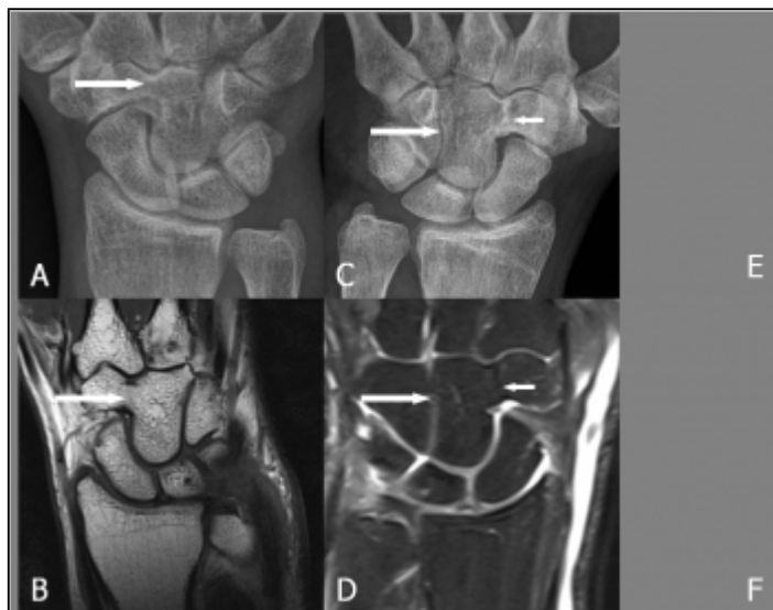
Figure 4 Isolated and combined asymptomatic CTC

(A-B) 38-year-old female (patient 3) with isolated CTC. Incomplete osseous fusion with distal joint space remnant (Minnaar type 2). (C-D) 63-year-old male (patient 4) with combined capitate-hamate (large arrows) and capitate-trapezoid (small arrows) coalition.