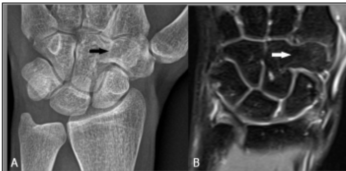
(A) Plain radiography. (B) Coronal SE T2-WI FS. Carpal coalition with complete osseous bridging. No adjacent bone marrow oedema.

© (1) Department of Radiology, St.-Maarten General Hospital, Leopoldstraat 2, 2800 Mechelen, Belgium