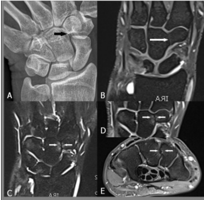
(A) Narrowed CTJ with irregular, sclerotic margins (arrow). (B) CTJ filled with fibrovascular tissue (long arrow), (B-E) There is a surrounding bone marrow oedema, presence of subchondral cysts and the margins are irregular (short arrows).