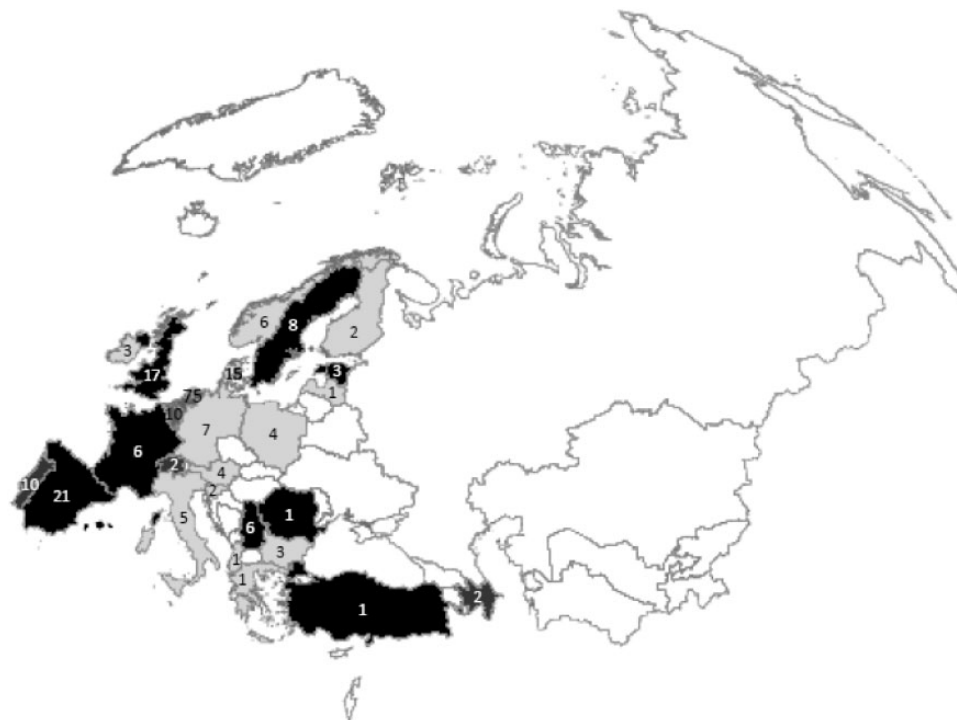
Figure 2 Map of the WHO European Region showing the total number of burden of disease studies conducted for each Member State and the most comprehensive type of study for each. Colours illustrate the most comprehensive type of study for each Member State as follows: light grey shading with black text—specific studies (including multicountry a ); dark grey shading with black text—extensive study; dark grey shading with white text—full, sub country study; black shading with white text—full, country study b

a Please note that specific multicountry studies that cover over half the Member States ( N=17 ) are not included on this map.