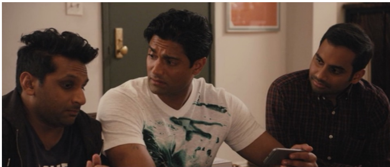
Figure 7: Issues of minority representation are challenged in Master of None . Netflix 2015–. Screenshot.