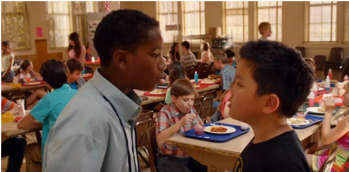
Figure 1 (above): The Huang family driving from Washington D.C. to their new home in Florida. Fresh off the Boat . ABC 2015–. Figure 2 (below): Eddie Huang (Hudson Yang), the rebellious protagonist, fighting about his culture with a peer at school. Fresh off the Boat . ABC 2015–. Screenshots.