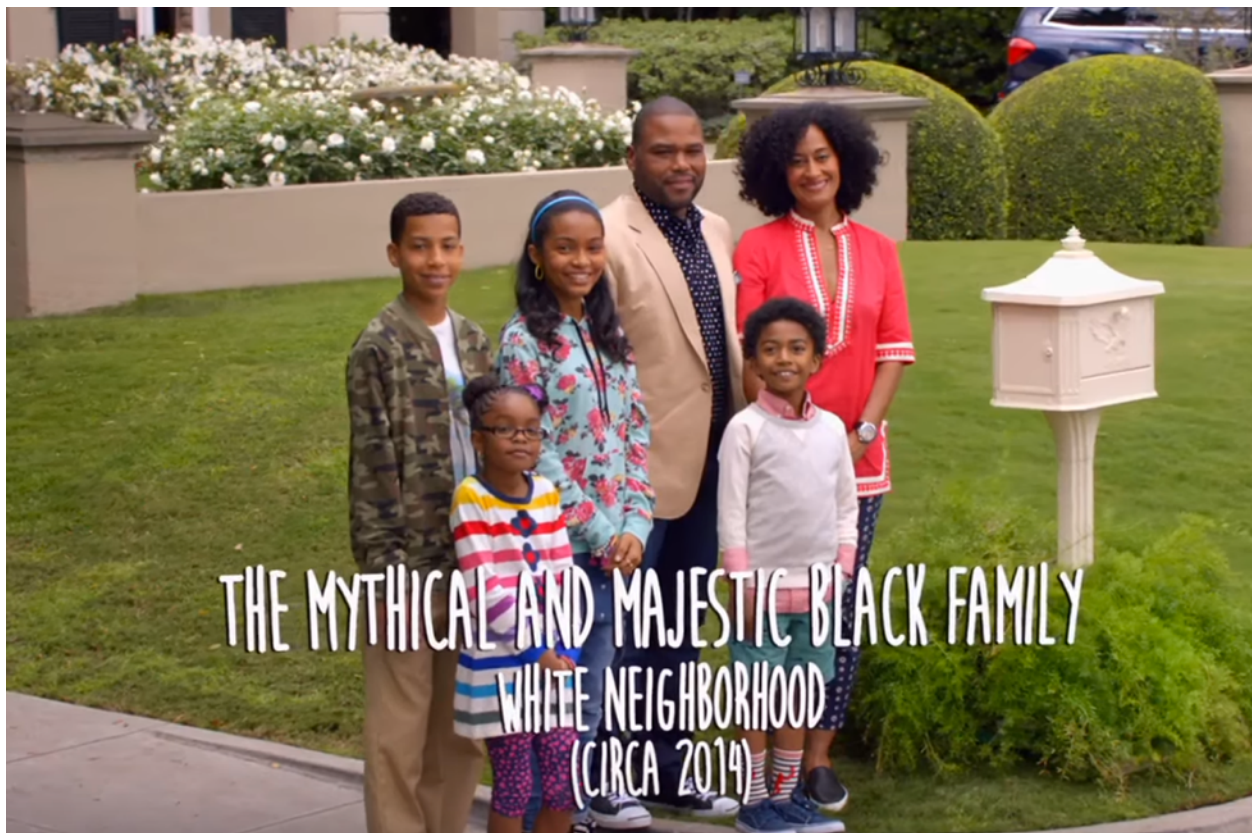
Figure 3: The Johnson family being presented as a “mythical” phenomenon in a white neighbourhood in Black-ish . ABC 2014–. Screenshot.