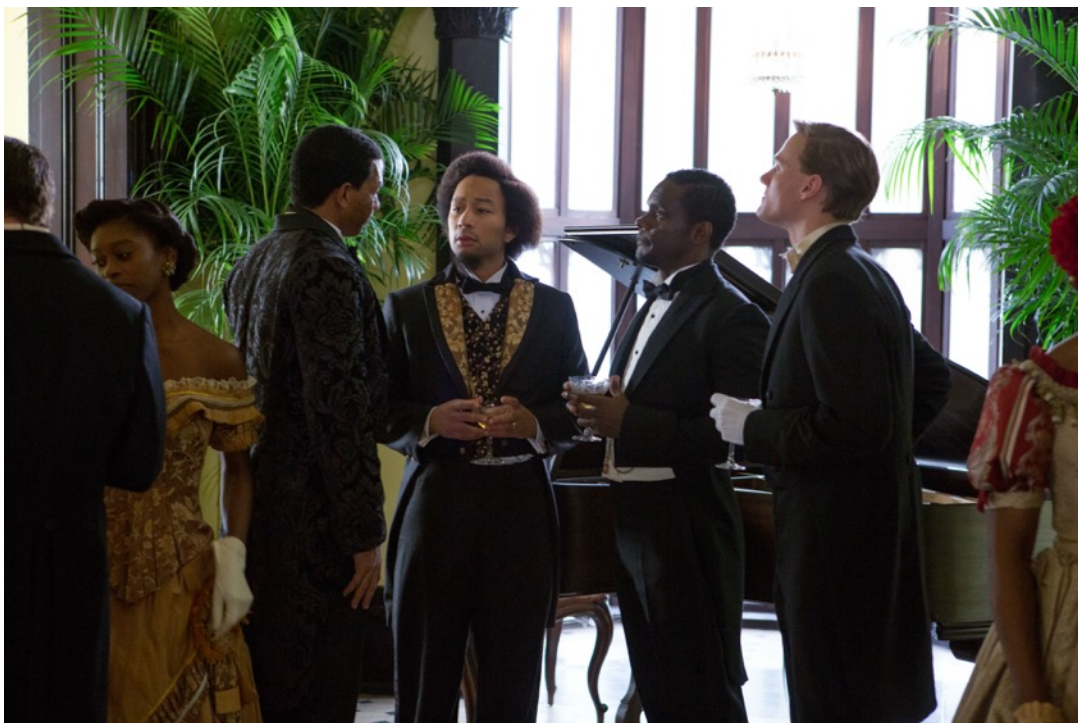
Figure 4 (above): Female-centric Underground portrays nineteenth century women fighting together against slave holders. WGN American 2016-. Figure 5 (below): Black and white Americans fighting together for the abolition of slavery in Underground . WGN American 2016-. Publicity stills.