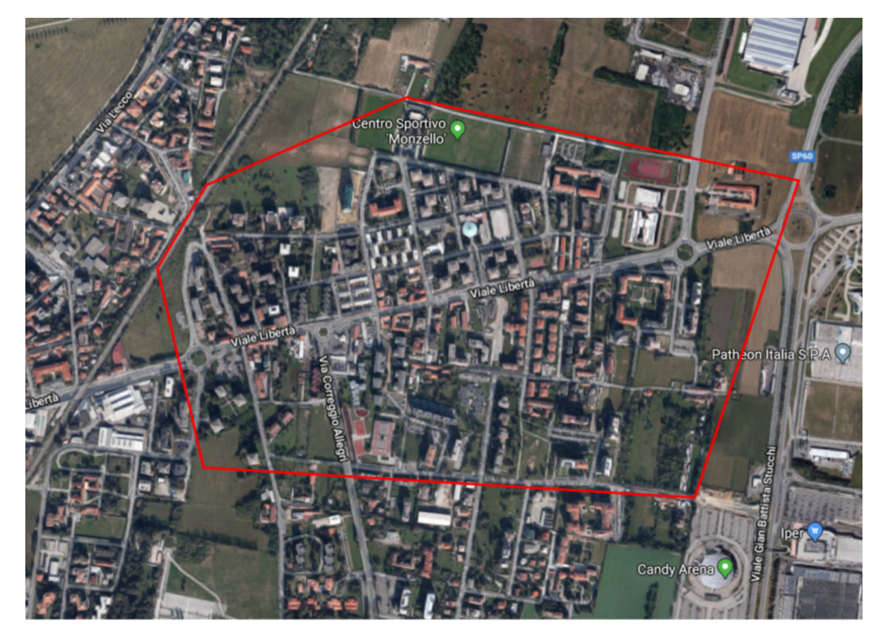
Figure 1: NLEZ pilot area boundaries (Libertà district).