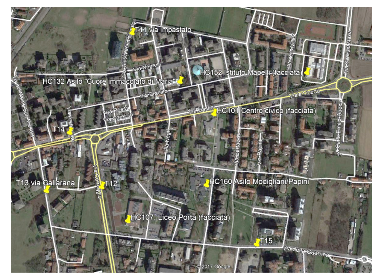
Figure 6: Selected noise monitoring positions.

tion in the Libertà district and taking into account the different typologies of streets and the presence of sensitive receivers ( e.g. schools). In particular, three microphones have been placed along the Viale Libertà, the main street of the district where the traffic flow mix is expected to mainly change from the ante to the post-operam scenario.