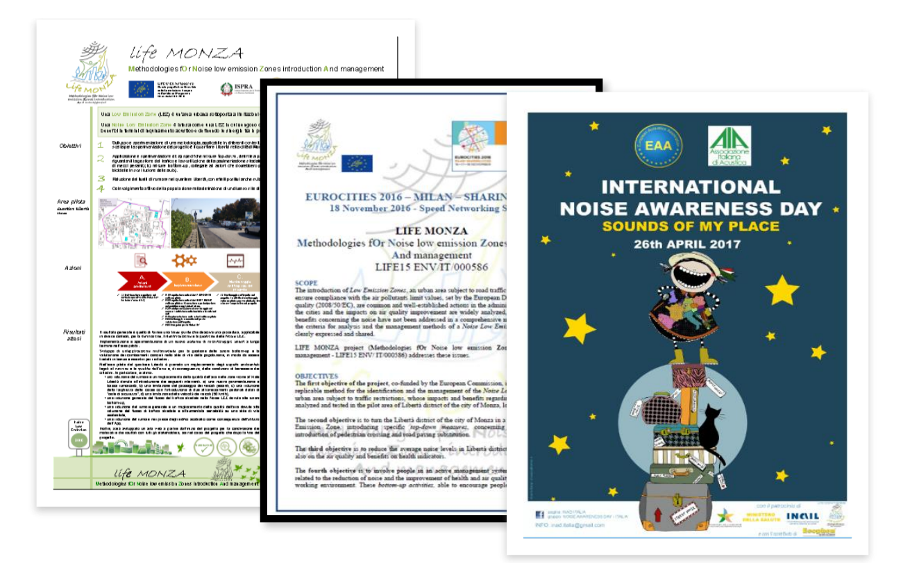
Figure 7: Documents presented during some dissemination events.

The parameters illustrated in Table 1 have been selected and agreed among Project partners to be introduced in the GI.