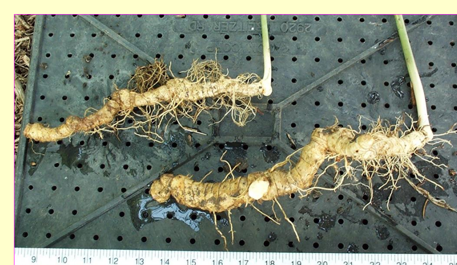
True Solomon's Seal