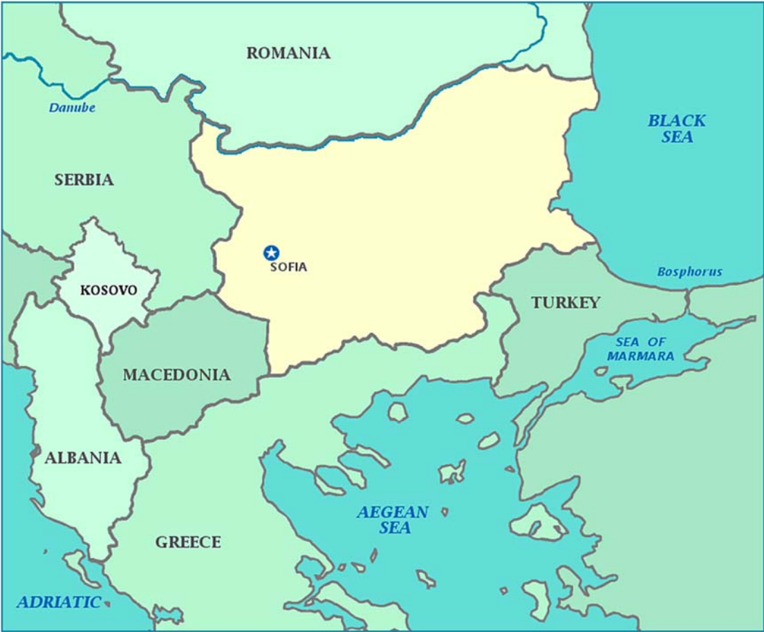
Taken from: www.yourchildlearns.com (Jan. 20, 2016)