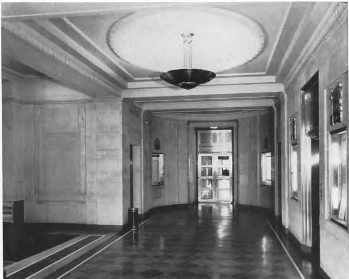
Entrance Lobby—Natural Resources Building.

As this is written, the Division of Architecture and Engineering is hard at work on contract drawings for the additions to the present building, virtually completing the group. After the war when labor and materials are available, Illinois will be ready to begin construction at once and when completed will have a plant second to none in this field. What its problems of the future will be no one really knows or can hardly guess. The horizon is limitless. Some day a new use for some material or plant will be discovered in one of these laboratories and a whole new industry will be born! Others are sure to follow. Our Division is extremely proud of its part in the development of this scientific group of buildings and feels it has had at least a small share in the development and future growth of our great state.