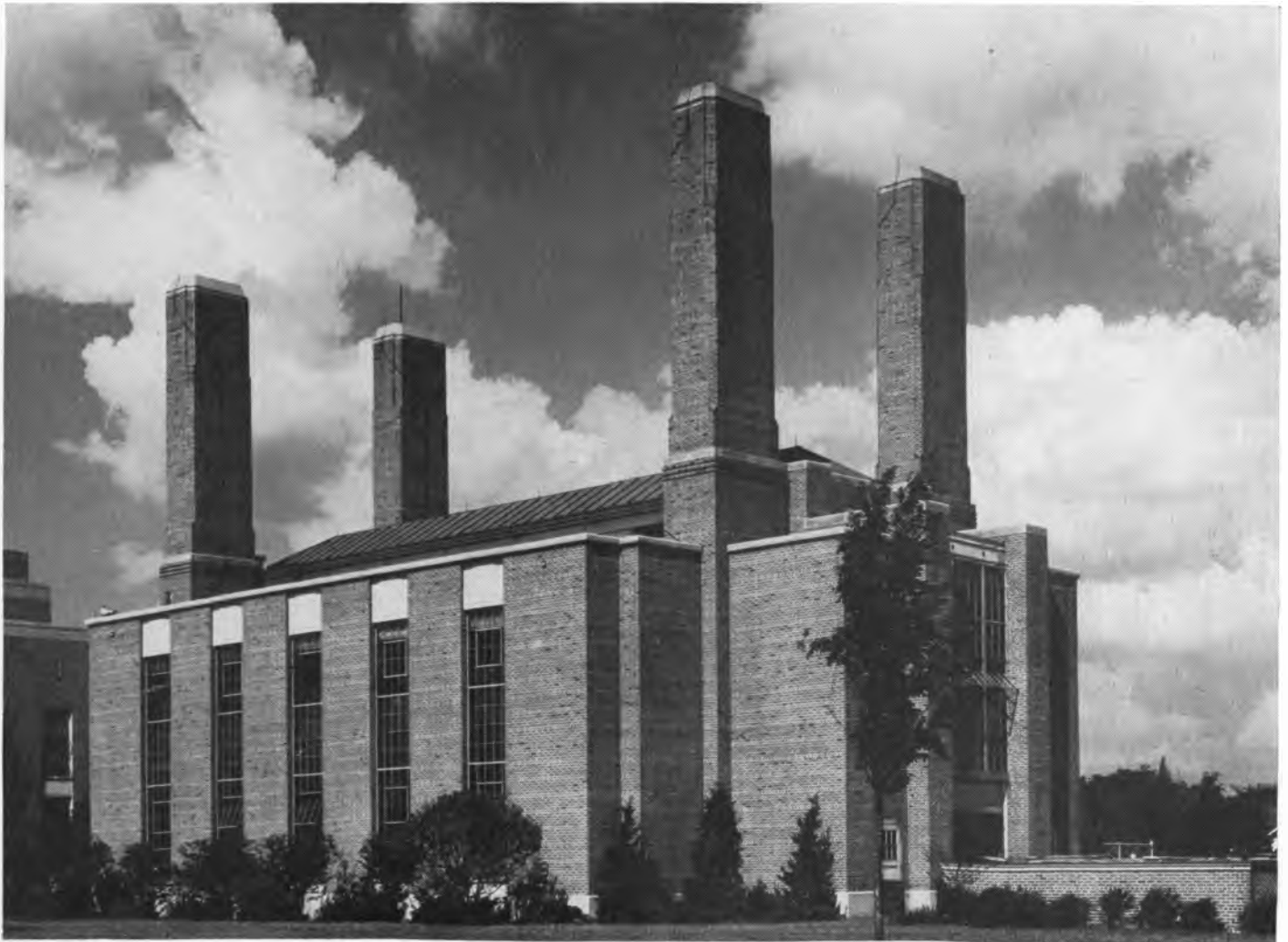
Applied Research Laboratory—State Geological Survey

We made a supreme effort to fit these individual units into the proposed shell of the building without radically changing their layouts. This was difficult to do, taking into account that the exterior windows, ceiling heights and similar features were determined for us by the exterior architecture. How much simpler it would have been, had we been able to start from scratch and design the exterior to fit the interior. However, the finished result is a union of these exterior and interior problems and, we believe, have been worked out in such a fashion that no one, unless made aware of the problem, realizes that the problem even existed. To cite an example, the