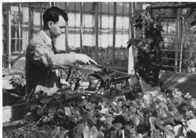
Research for garden insect control is continuous throughout the year. Experimental Greenhouse—State Natural History Survey.

Now after four years' service how have things worked out? "The proof of the pudding is in the eating" so a brief description of some of the "special projects" previously referred to, will serve to show how the building is serving both the state and nation, during these war years. In 1937, the oil boom in Illinois brought great activity to southeastern Illinois. Hundreds of new wells were drilled in the geologists' "virgin" territory. These wells passed through hitherto uncharted coal veins. After awhile wells cease to pay pumping and other costs—they must be rejuvenated by artificial water, air or gas pressures, which are termed secondary