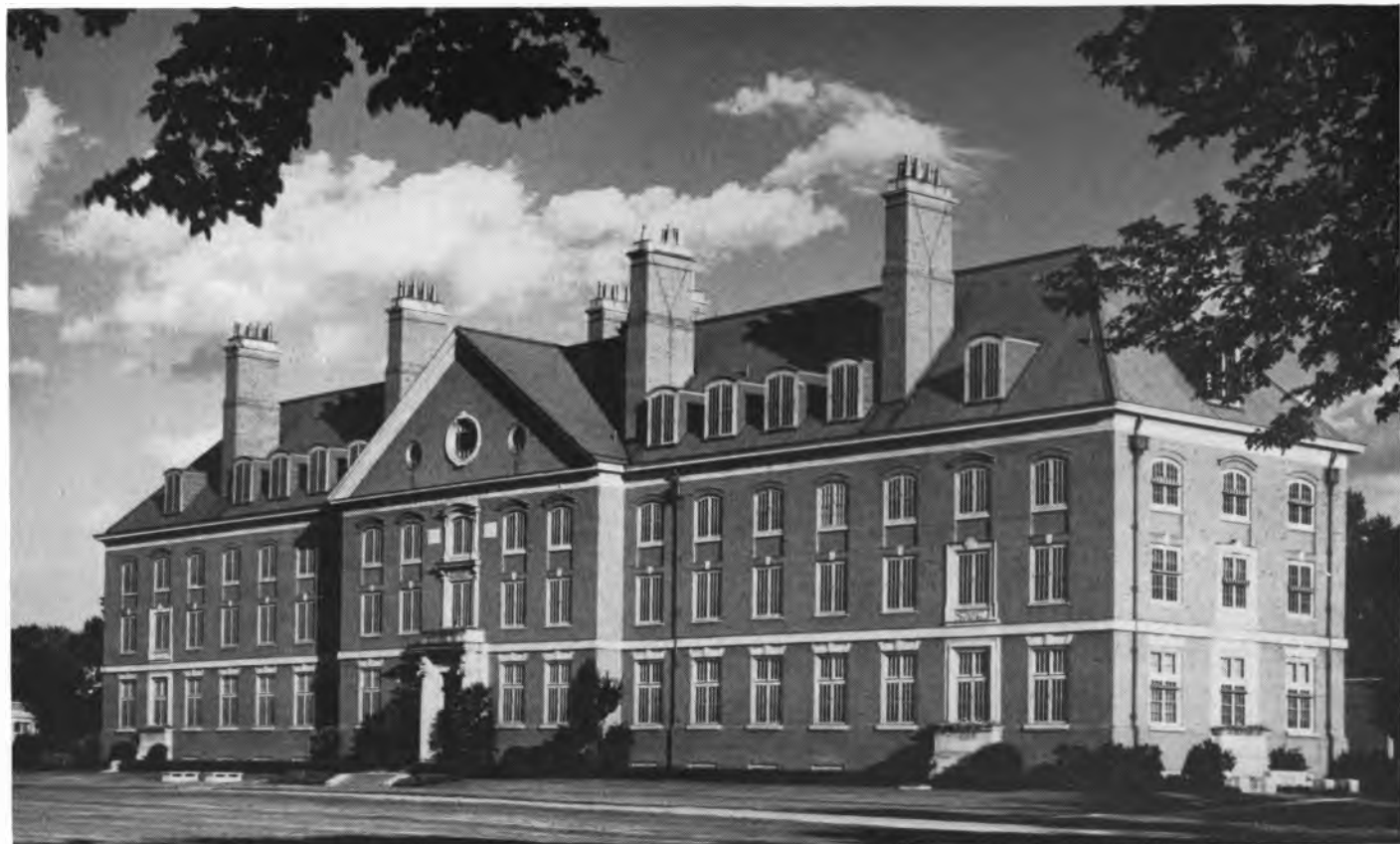
Natural Resources Building, University of Illinois Campus, Urbana-Champaign. Completed 1940.

Illinois is now well equipped to learn more about her resources. The Natural Resources Building, occupied by the State Geological and Natural History Surveys, on the campus of the University of Illinois, was completed in 1940. The completion of this structure concluded a vital period of planning and construction, important to the future growth and development of the State of Illinois. This period of planning began with the study of the purposes, aims and work of the two Surveys, an examination of their meager existing and scattered facilities, and their desire to unify their services on one plot and largely under one roof, and ended with the completed structure, a "tailor-made" plant, ready for action. In between is the record of the assembling of technical and scientific requirements and the solution of endless knotty problems, resulting in a modern plant for the adequate study of the potential-