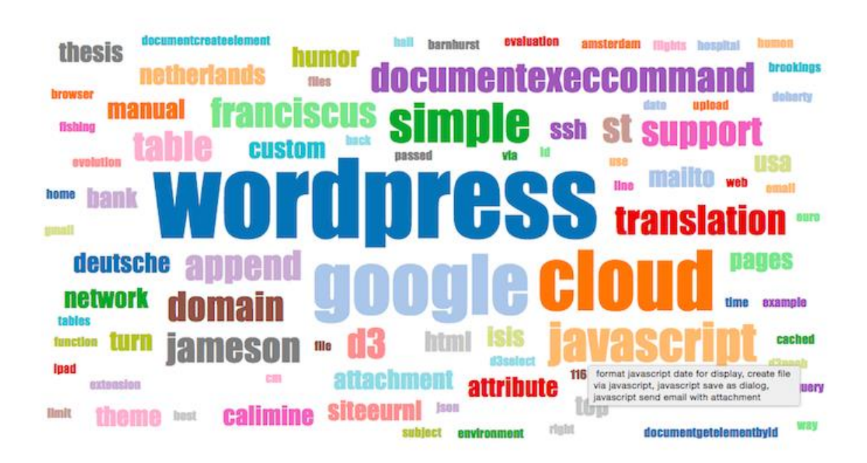
Figure 2. Search Words, seven days: Word size increases when it is used in different search terms. Tooltip shows the search terms in which the word appears. Word color is arbitrarily selected from a color palate.