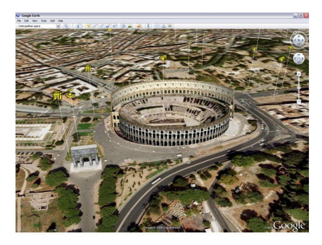
Figure 2. Screen shot of Google Earth around the Colosseum.

There were some other potential pitfalls, some of which became apparent only after the project was well along. The interface has limited context for data; a layer shows primarily graphic information (placemarks, terrain, and buildings), but users must click on placemark icons or borders to call up explanations of the data. The information bubbles are also somewhat small, especially if they also contain images and links. More detailed explanation and documentation would need to be placed on landing pages (external HTML pages which are reached by a href link in the information bubble). The 3D buildings in KML are low-resolution, essentially cylinders and rectangles with flat textures, which meant that many details in Rome Reborn 1.0 would not be visible. Corrections or additions to the textual information would be nearly impossible once the layer was released, since the text in the layer would be translated into several languages (Google Earth supports more than twenty languages) and distributed on Google's servers all around the world.