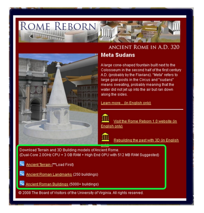
Figure 8. Downloading options in Ancient Rome 3D information balloon.

The information balloons were edited, as shown in figure 8, to include links to download the terrain and buildings in separate steps. This adjustment was necessary to make sure that the entire Google Earth application would open in a reasonable period of time. This is not ideal, but it does work. We lost some of the functionality of our design, but the layer is still useful, informative, and educational.