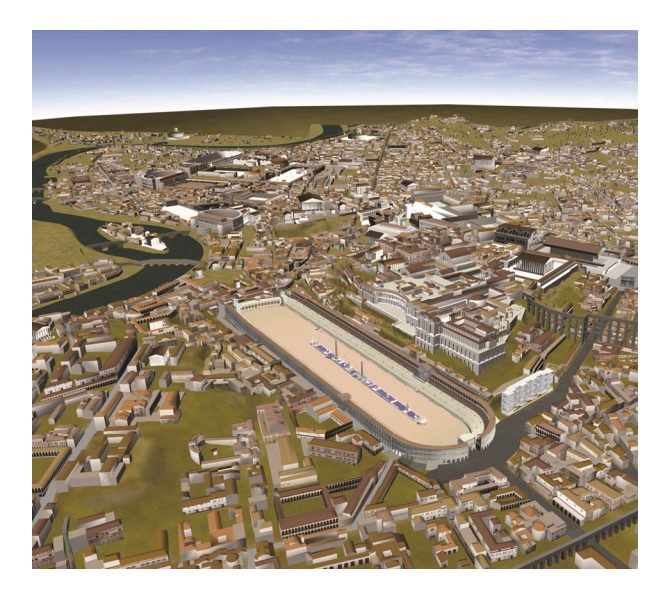
Figure 1. Rome Reborn 1.0.

Rome Reborn 1.0 contains about 7,000 buildings, which for the purposes of the model were divided into Class I and Class II categories. The Class I category is for landmarks and other features that are well-known and for which there is documentary information about their location, function, size, and appearance. Class II covers buildings and features whose existence is documented but whose actual location, appearance, and size are not known (e.g., apartment buildings, single family dwellings, warehouses, and shops). Approximately 250 buildings in the model are marked as Class I, and the remainder belong to Class II.