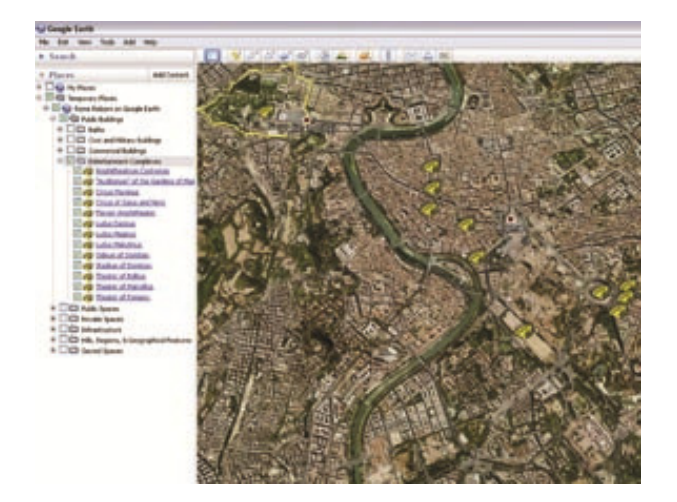
Figure 5. Hierarchy of objects in Ancient Rome 3D layer.