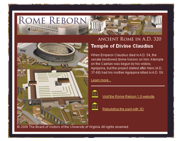
Figure 4. Design of information balloons.

To keep the information balloons at a reasonable size, the object descriptions (written primarily by Bernard Frischer) were kept to a few sentences. Ideally, those few sentences would contain intriguing facts that would drive the user to want to know more, but while life in Rome was undoubtedly violent and full of incident, accounts of dramatic events set in specific places survive only sporadically. In lieu of this, the descriptions provide brief summaries of the significance of each marked object. In cases where the description was too long, an ellipsis noted the break and the entire description was provided on the landing page.