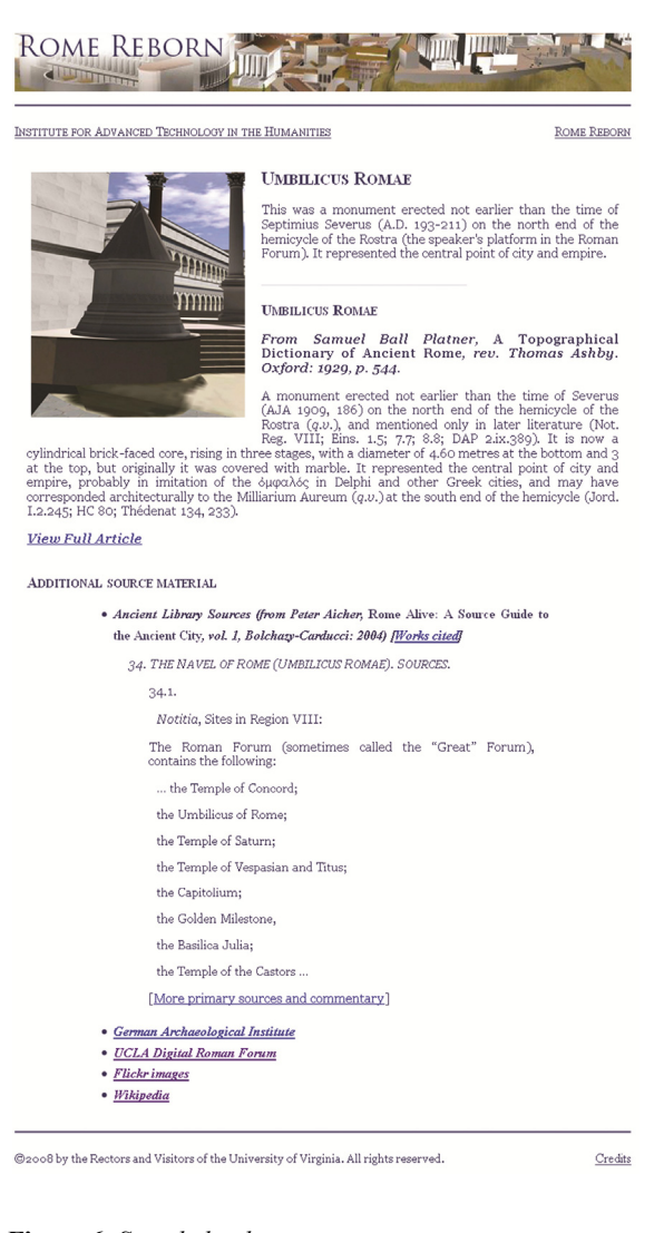
Figure 6. Sample landing page.

The landing pages were a more straightforward undertaking, in part because they are external to the