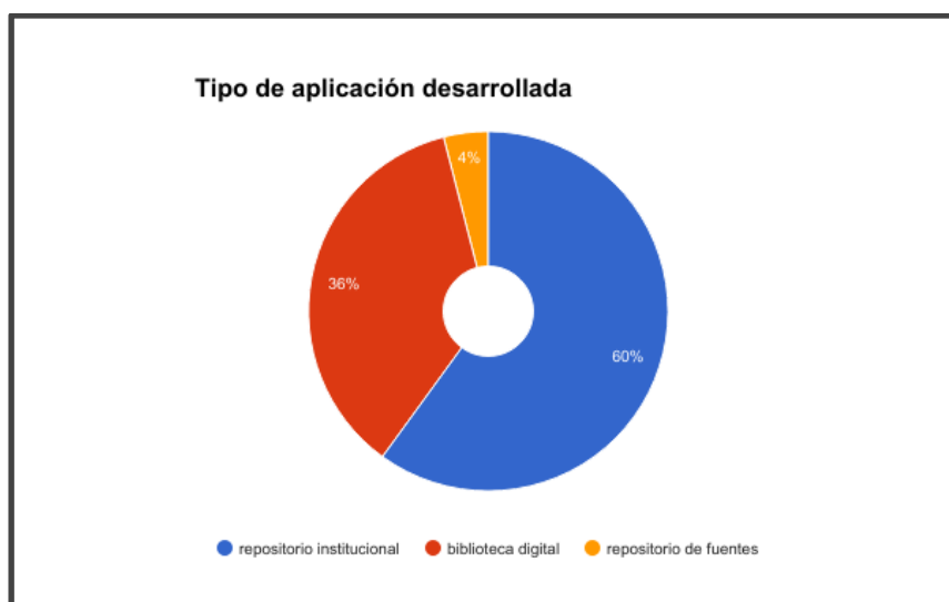
Graph 1. Type of application developed with Greenstone

If we look at the type of application developed, the total list shows that 16 cases are digital institutional repositories, 8 are digital libraries dedicated to a particular subject (eg surveying) or a documentary type (eg photographs), and 1 case is a digital repository of research sources: