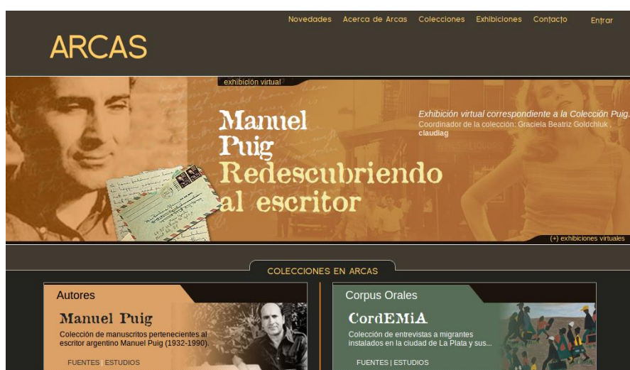
Figur2 2. ARCAS Homepage

The first one is ARCAS, the repository of research sources inaugurated in 2014 which combines the use of Greenstone version 3 together with a content management system (Plone) for user management and updating of contents of the site through a web form. In this case, and since it is a relatively new development, it was developed with version 3 from the very beginning, so there was no work of migration or adaptation of pre-existing collections.