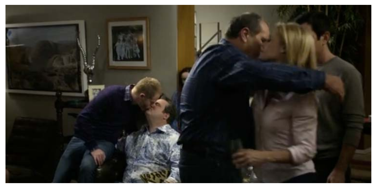
Cam and Mitchell kiss for the first time on Modern Family, in the second episode of the second season.

Whenever it looked like he might be about to kiss, the camera panned away discreetly. Sit-com Will and Grace (1998-2006) went several seasons before gay character Will ever kissed a male partner. Modern Family's Cam and Mitchell live together and have adopted a child, but it wasn't until season two that they exchanged even the most innocent of kisses. Australian television has been equally reticent. Long-running soap opera Neighbours (1987-) waited 27 years before showing two of its male characters kissing.